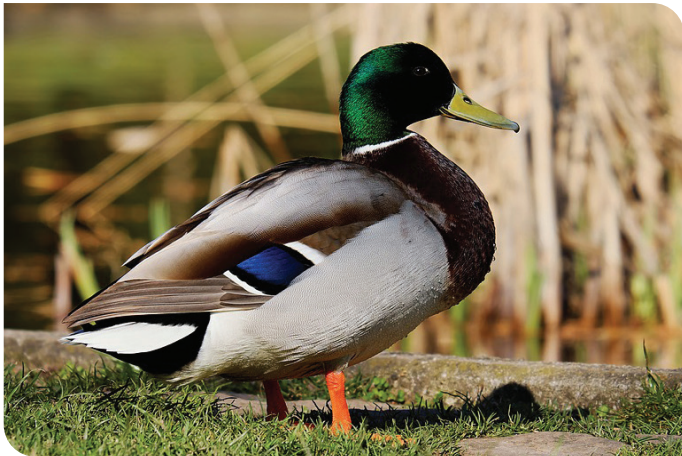
Mallard Anas platyrhynchos