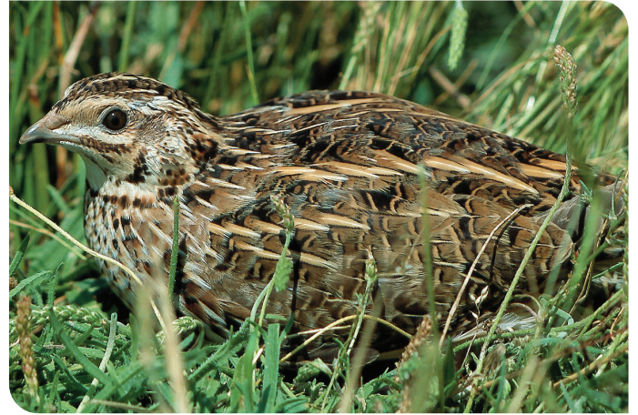
Common Quail Coturnix coturnix