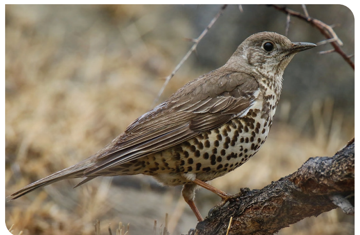
Mistle Thrush Turdus viscivorus