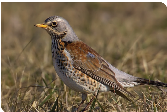
Fieldfare Turdus pilaris