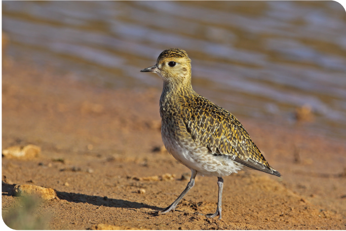
Eurasian Golden Plover Pluvialis apricaria