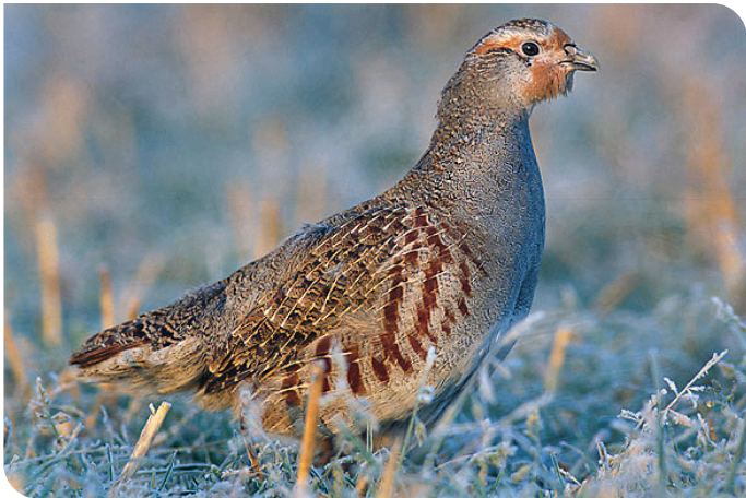
Grey Partridge Perdix perdix