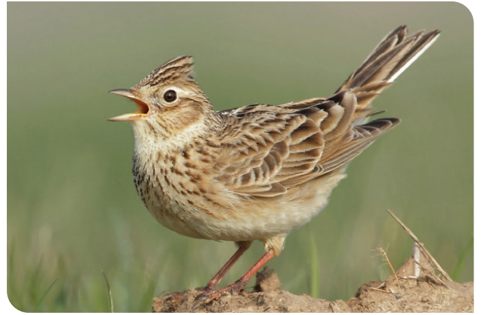
Eurasian Skylark Alauda arvensis