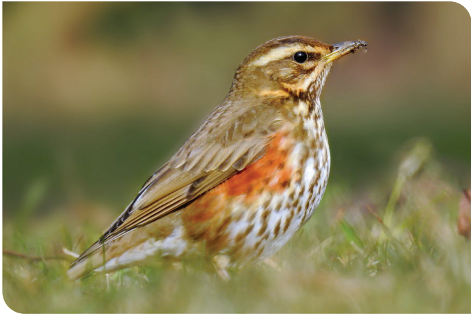
Redwing Turdus iliacus