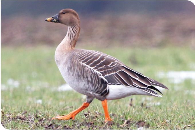
Bean Goose Anser fabalis