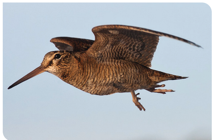
Eurasian Woodcock Scolopax rusticola