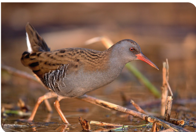
Western Water Rail Rallus aquaticus