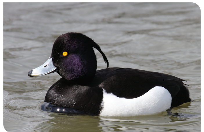
Tufted Duck Aythya fuligula