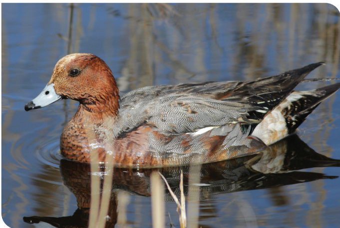
Eurasian Wigeon Mareca penelope