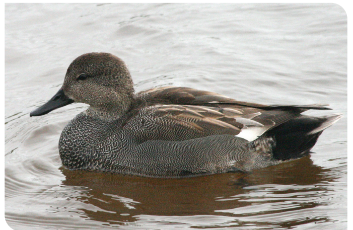
Gadwall Mareca strepera