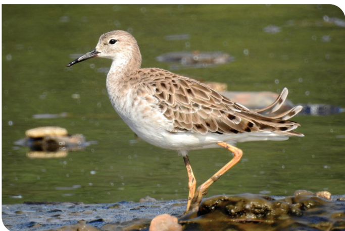
Ruff Calidris pugnax