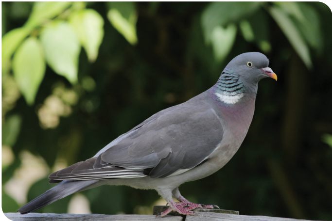
Common Woodpigeon Columba palumbus