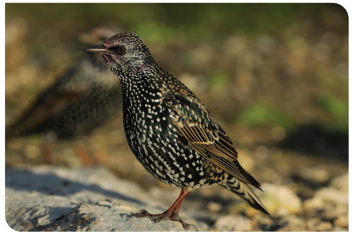
Common Starling Sturnus vulgaris