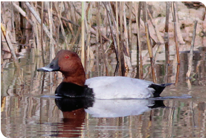
Common Pochard Aythya ferina