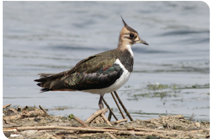
Northern Lapwing Vanellus vanellus