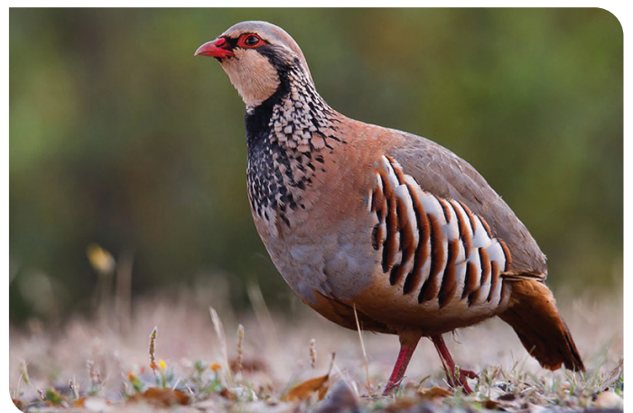
Red-legged Partridge Alectoris rufa