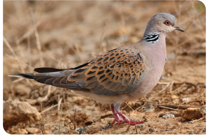
European Turtle-dove Streptopelia turtur