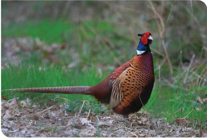
Common Pheasant Phasianus colchicus