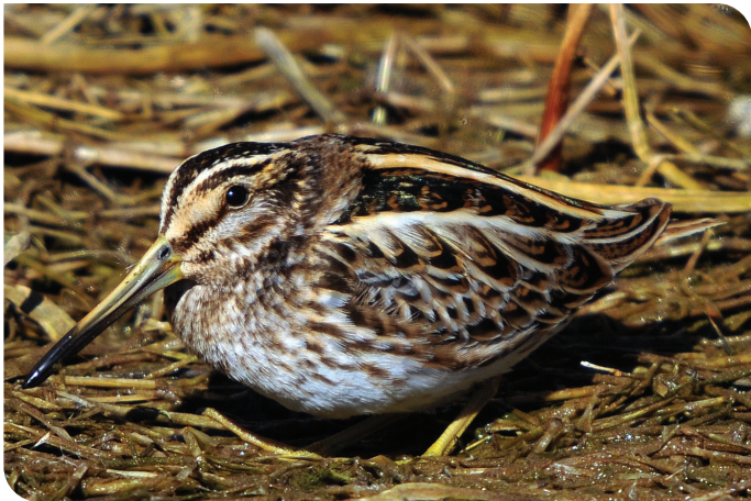
Jack Snipe Lymnocyptes minimus