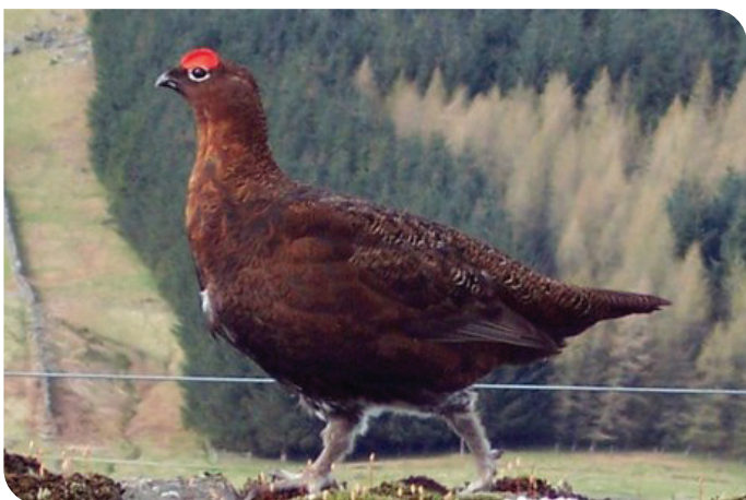
Scottish Red Grouse Lagopus lagopus scoticus