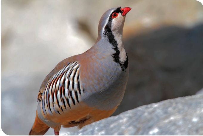
Rock Partridge Alectoris graeca