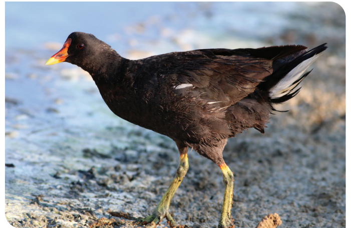
Common Moorhen Gallinula chloropus