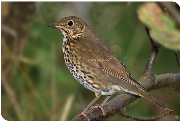
Song Thrush Turdus philomelos