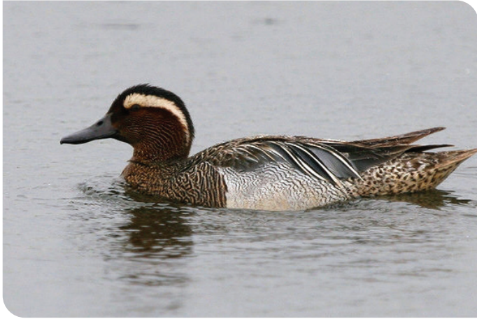
Garganey Spatula querquedula