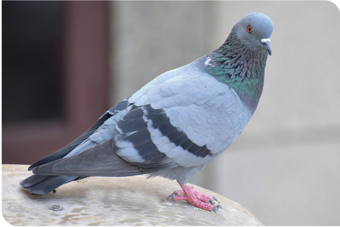
Rock Dove Columba livia