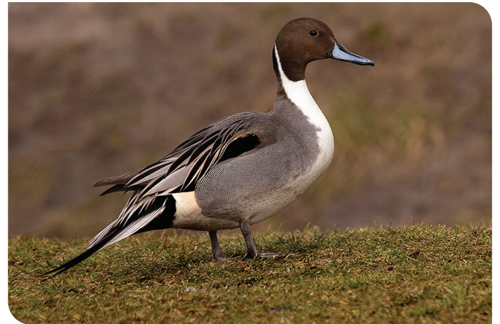
Northern Pintail Anas acuta