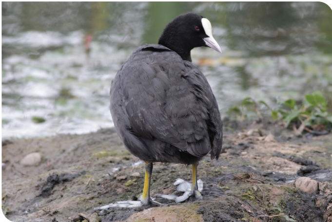
Common Coot Fulica atra