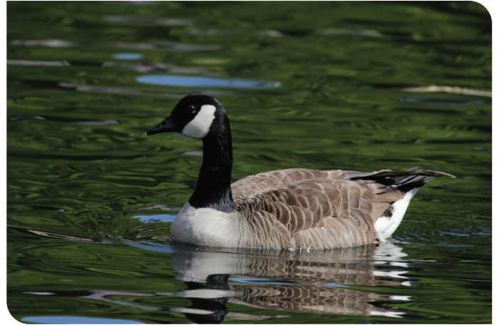
Canada Goose Branta canadensis