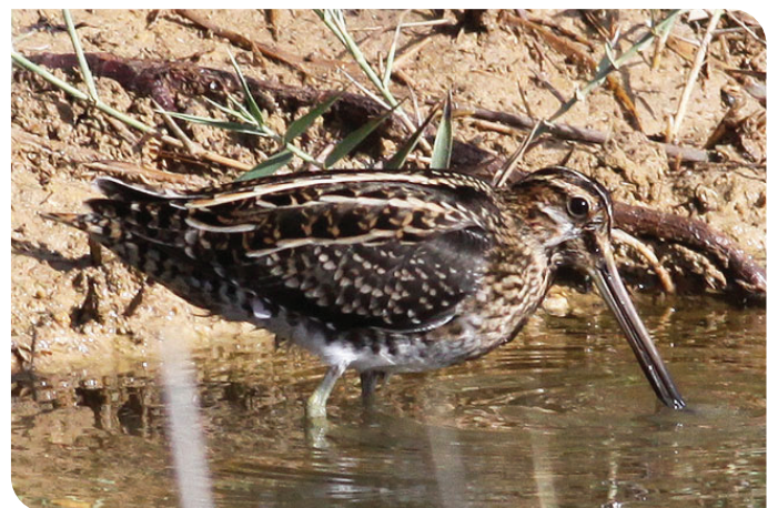
Common Snipe Gallinago gallinago