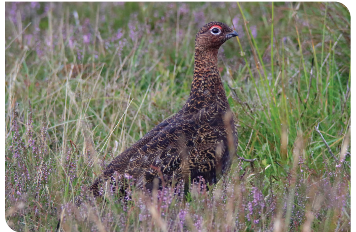
Irish Red Grouse Lagopus lagopus hibernicus