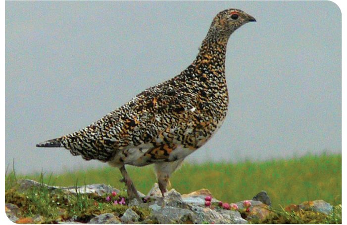
Rock Ptarmigan Lagopus muta