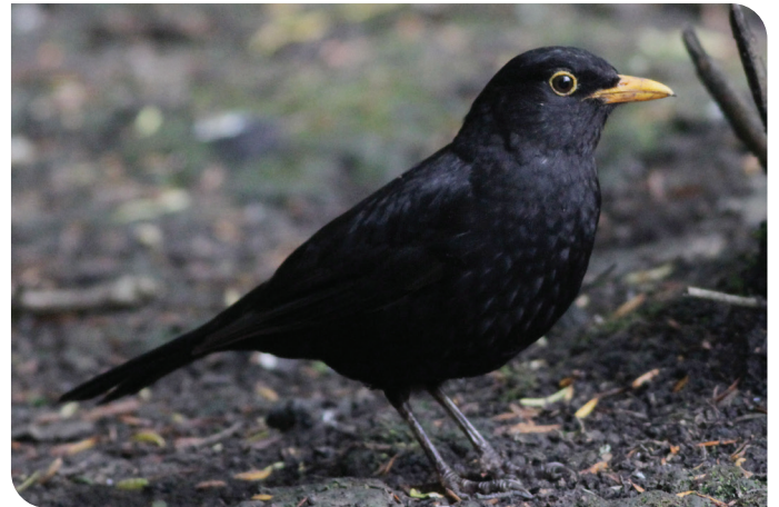
Eurasian Blackbird Turdus merula