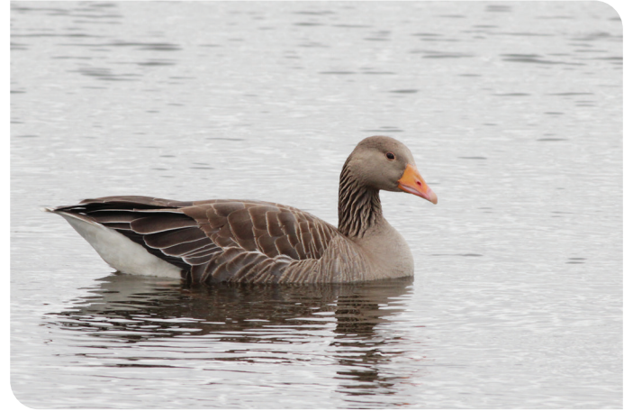
Greylag Goose Anser anser