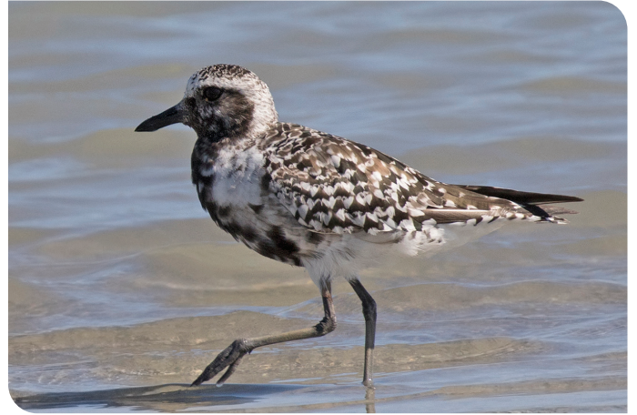
Grey Plover Pluvialis squatarola