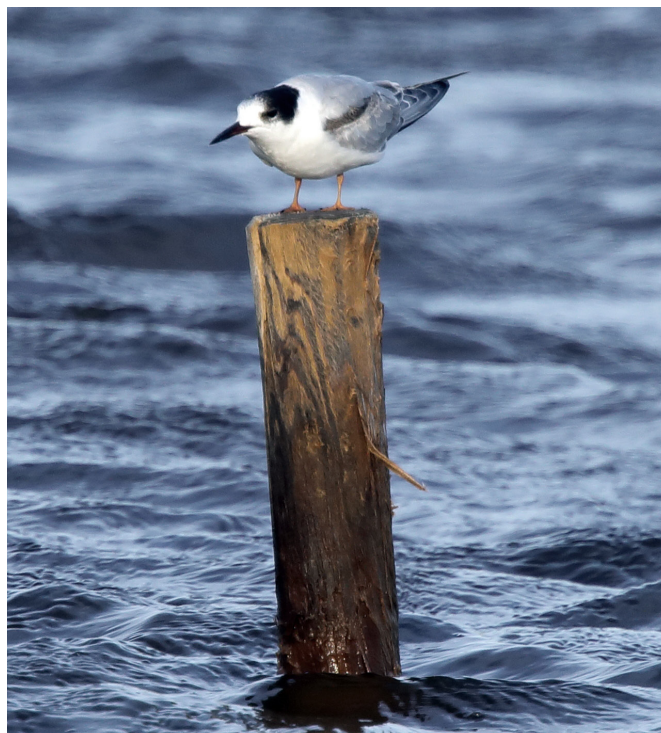
Fig. 12. Common Tern (Ghadira NR, 25 Apr)