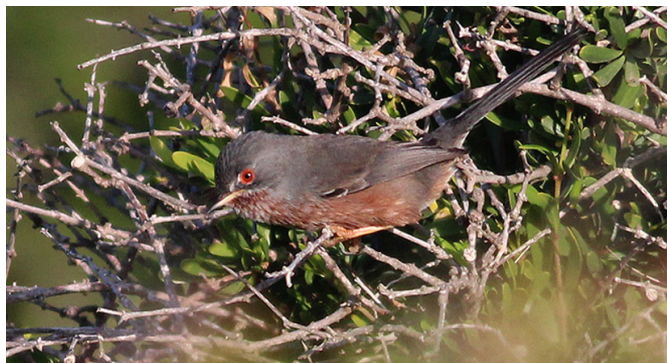
Fig. 23. Dartford Warbler (Majjistral, 27 Dec)