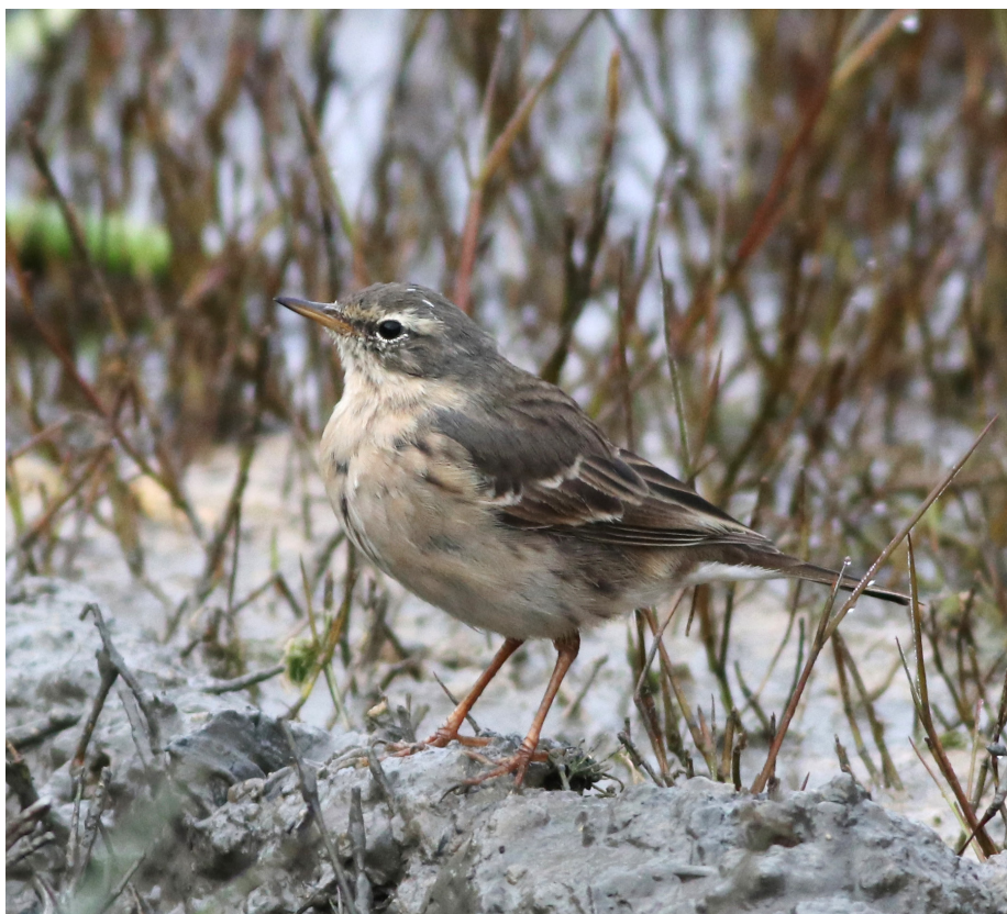
Fig. 28. Water Pipit (Wied Ghajn Rihana, 13 Mar)

25 ringed (6 from Jan–Mar, 19 from Oct–Dec), most (9) at Ghadira NR. 1 ringed in Poland observed.