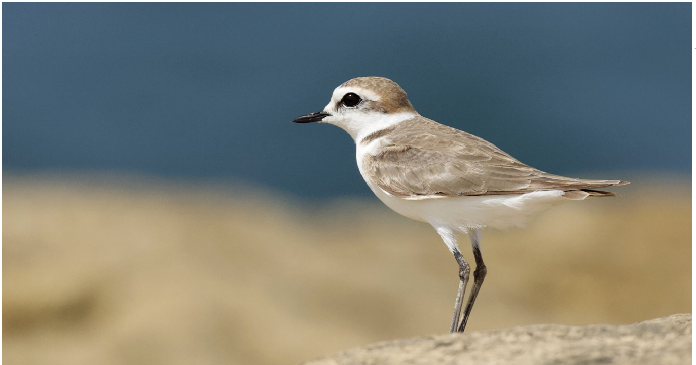
Fig. 07. Kentish Plover (Jerma Pt, 18 Aug)

Singles at Salina NR from 05–08 May, at Qbajjar on 13 Oct, and at Għadira NR on 20 Nov.