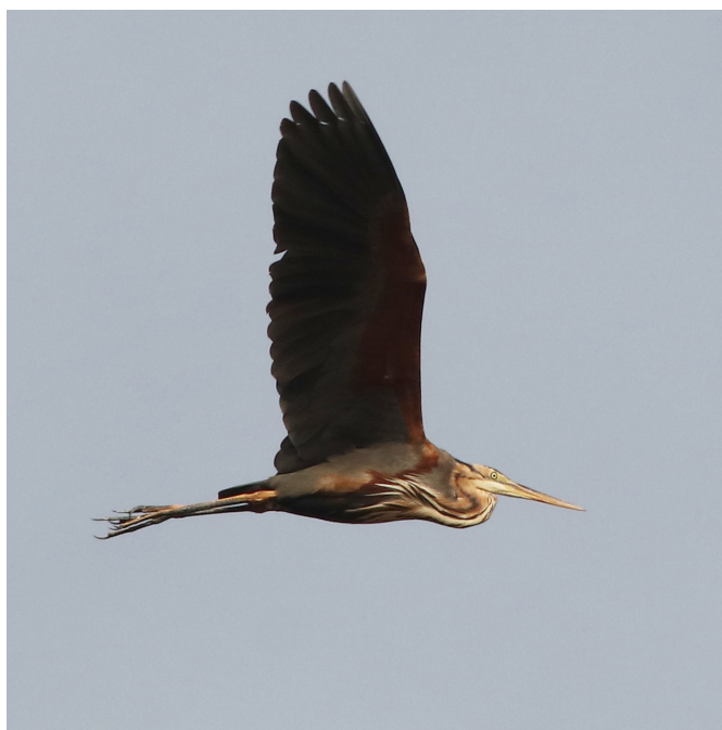
Fig. 06. Purple Heron (Ghadira NR, 4 Sep)