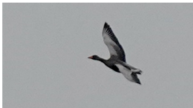
Fig. 01. Greylag Goose (Miġra l-Ferħa, 28 Oct)

2 at Żonqor on 14 Jan, 5 at Qawra on 17 Jan, 3 at Qbajjar on 17 Jan and singles at Ghadira NR on 21 Jan and 07 Feb.