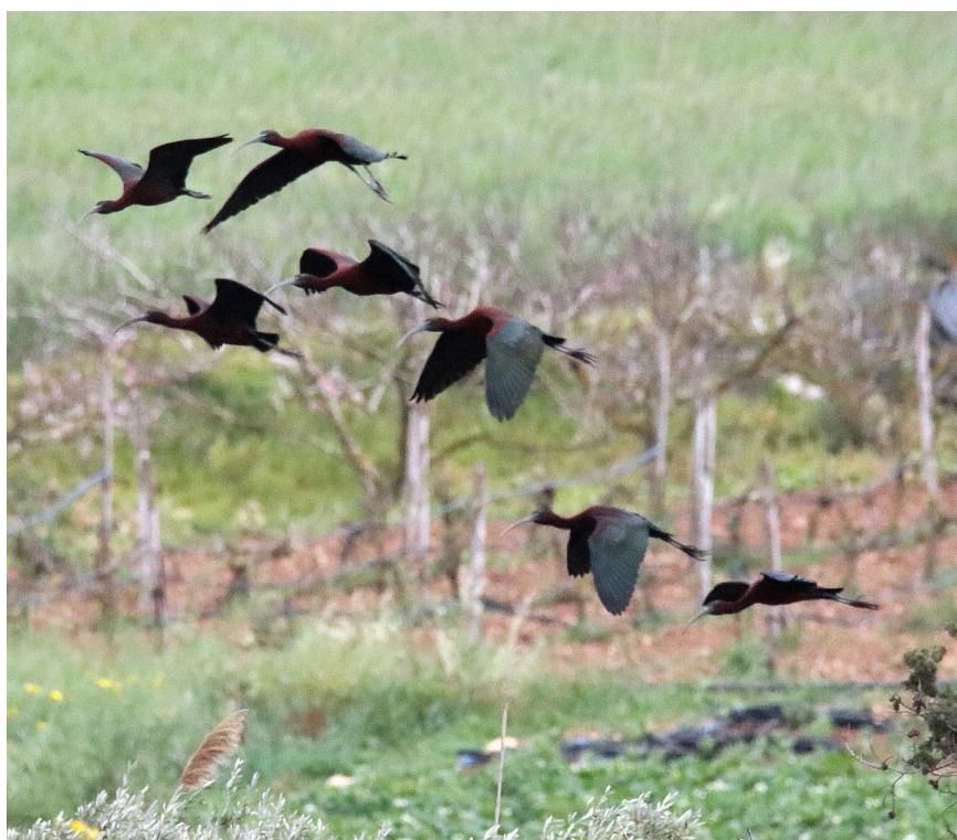
Fig. 05. Glossy Ibis (Simar NR, 5 Apr)

In spring, regular sightings from 20 Mar to 28 May, mostly single or low double figures, max. 37 at Kemmuna, 15 at Ħal Far on 24 Apr and 15 at Simar NR on 14 May. Up to 4 present at Simar NR throughout Jun and Jul. In autumn, regular sightings from 12 Aug to 26 Oct, mostly single or low double figures, max. 40 at Valletta on 14 Aug, 23 at Buskett on 30 Aug and 26 at Blata