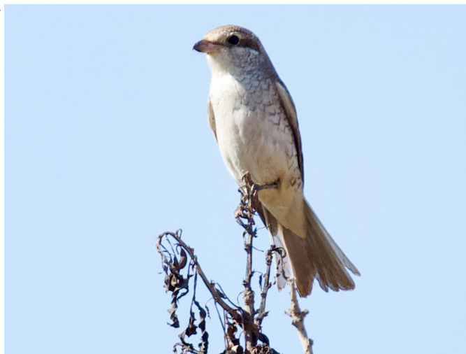
Fig. 16. Red-backed Shrike (Kemmuna, 8 Sep)

dates from 30 Sep to 21 Oct mainly at Buskett and 1 on 15 Nov at Salina NR.