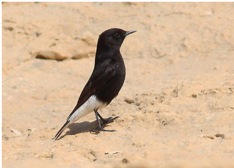
Fig. 27. White-crowned Wheatear (Dwejra Gozo, 17 Oct)