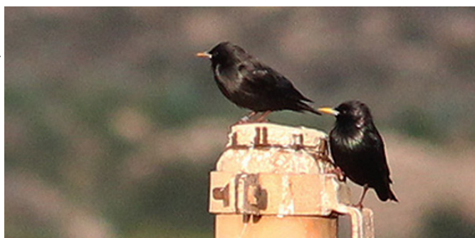
Fig. 24. Spotless Starlings (Kemmuna, 21 Feb)

at Ghadira NR on 08 and 11 Sep then daily from 24 Sep to 31 Dec, frequently in triple figures with regular counts of 1000. Max. 6000 at Marsa on 11 Nov.