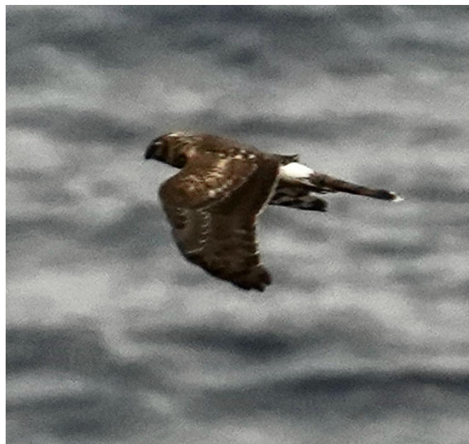
Fig. 14. Hen Harrier (Miġra l-Ferħa, 28 Oct)

Early bird on 11 Feb, then on most dates from 04 Mar to 30 Apr,