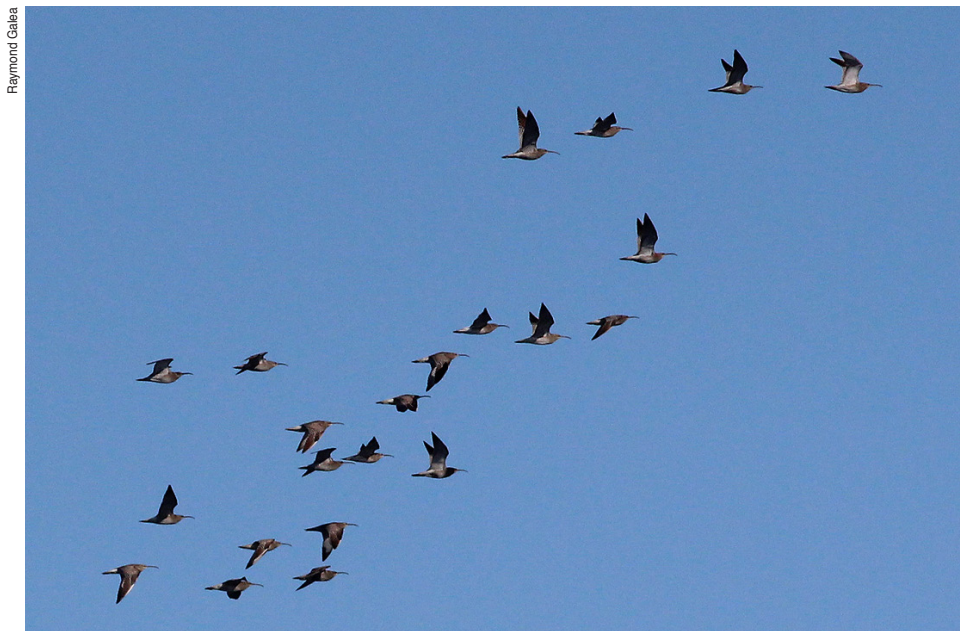
Fig. 08. Whimbrels (Ġirkewwa, 26 Mar)