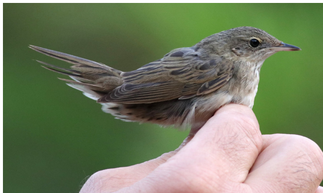
Fig. 20. Common Grasshopper-warbler (Ghadira NR, 04 Sep)