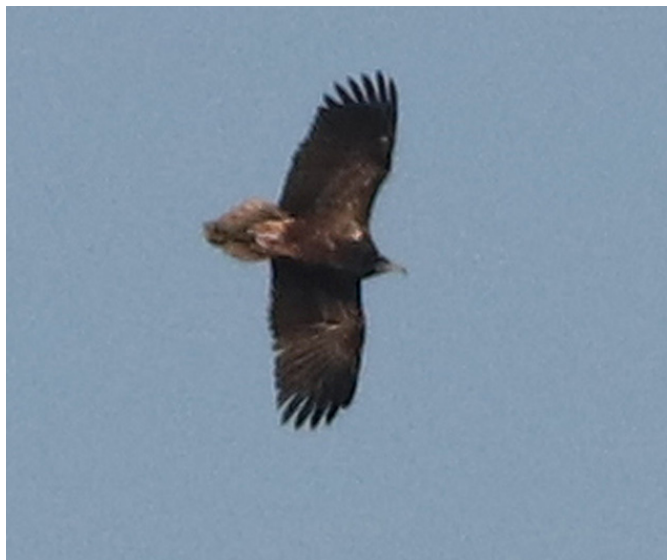
Fig. 13. Egyptian Vulture (Buskett, 14 Sep)

mostly at Buskett and regularly in double and triple figures with max. 200 on 16 Sep, 200 on 24 Sep and 180 on 25 Sep.