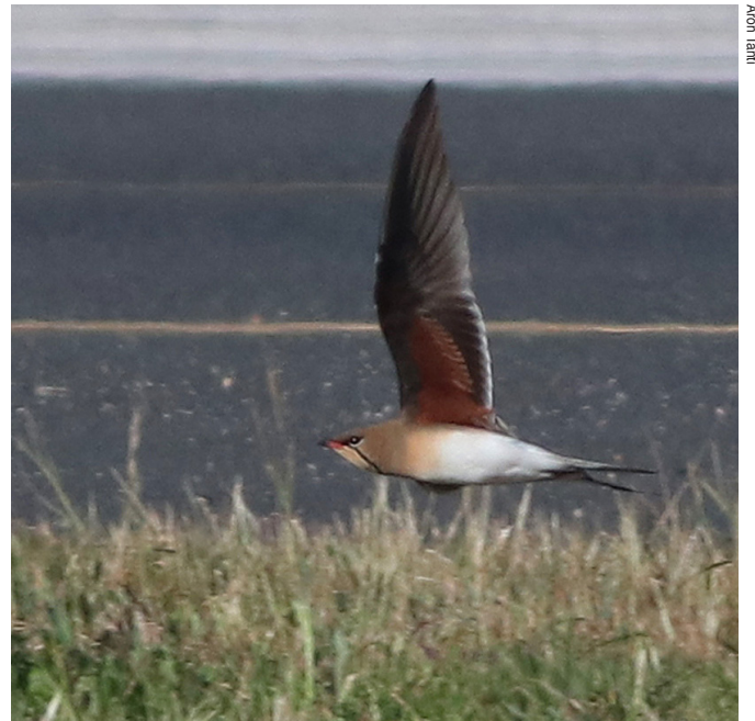
Fig. 10. Collared Pratincole (Airport, 25 Apr)

3 ringed in Italy and 1 ringed in Croatia observed.