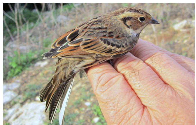
Fig. 29. Little Bunting (Salina NR, 14 Oct)

1 ringed at Salina NR on 14 Oct (Fig. 29).