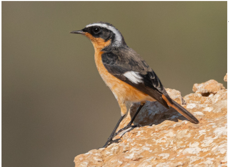
Fig. 26. Moussier's Redstart (Majjistral, 20 Oct)

142 ringed (all in spring), most (54) at Kemmuna.