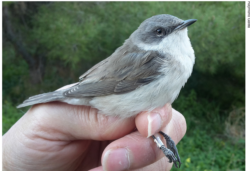
Fig. 22. Lesser Whitethroat (Ghadira NR, 16 Jan)

In spring, sightings almost daily from 08 Mar to 08 May, mostly