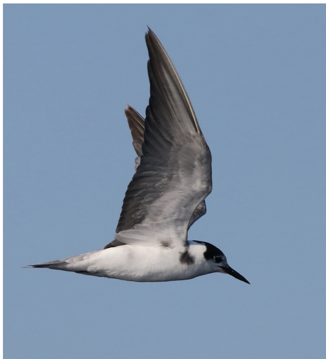
Fig. 11. Black Tern (Marsaskala offshore, 28 Aug)