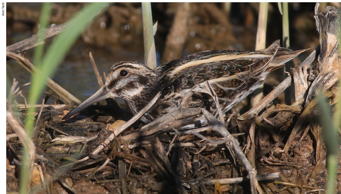
Fig. 09. Jack Snipe (Pwales, 8 Dec)

33 ringed [of which 16 (excluding confiscated birds) in autumn], most (21) at Ghadira NR.