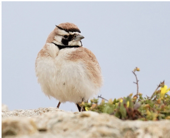
Fig. 17. Temminck's Lark (Ħal Far, 24 Apr)