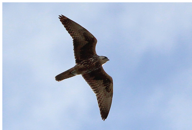
Fig. 15. Saker Falcon (Buskett, 9 Oct)

1 unusual record on 17 Feb at Cospicua. Then singles on 8