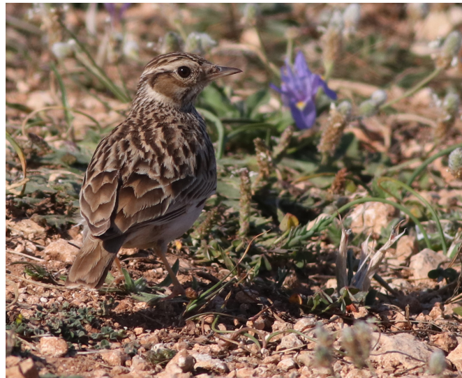
Fig. 18. Woodlark (Xrobb l-Għaġin, 30 Mar)