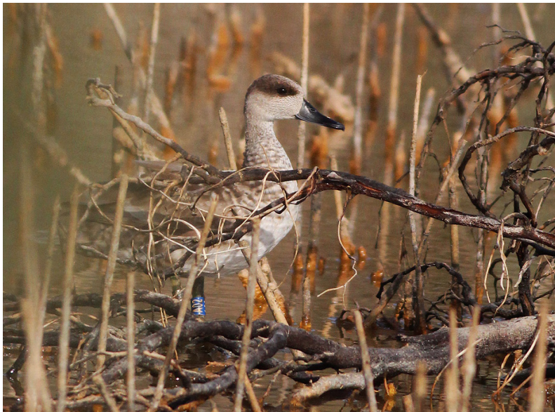
Fig. 02. Marbled Teal (Ghadira, 4 Jul) from Sicily re-introduction project

Then recorded in single and double figures of up to 24 on 10 dates (mainly from Malta-Gozo channel) from 27 Feb to 01 Apr, but 35 on 16 Mar. 1 at Simar NR from 24 Mar to 02 Apr. 1 at Salina NR on 08 Aug. Sightings on 19 dates from 28 Oct to 30 Dec including 15 on 30 Oct and 45 on 20 Nov at Qawra, 55 on Kemmuna on 21 Nov, 26 at Tas-Safra on 21 Dec and 11 at Wied il-Ghasri on 26 Dec.