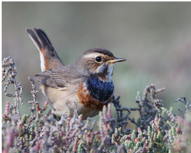
Fig. 25. Bluethroat (Ballut ta' Marsaxlokk, 21 Feb)

or low double figures with max. at Buskett of 28 on 01 Jan, 32 on 20 Feb and 29 on 21 Feb, and 25 at Kemmuna on 21 Feb. In summer, 1 of unknown origin at Chadwick Lakes on 31 Jul. Then almost daily from 12 Oct to 31 Dec, mostly single or double figures with max. 100 at Mtaħleb on 18 Oct, 420 at Girgenti, 130 at Majjistral and 100 at Buskett on 19 Oct, 350 at Dwejra (G) on 20 Oct and 250 at Miġra l-Ferħa on 28 Oct.