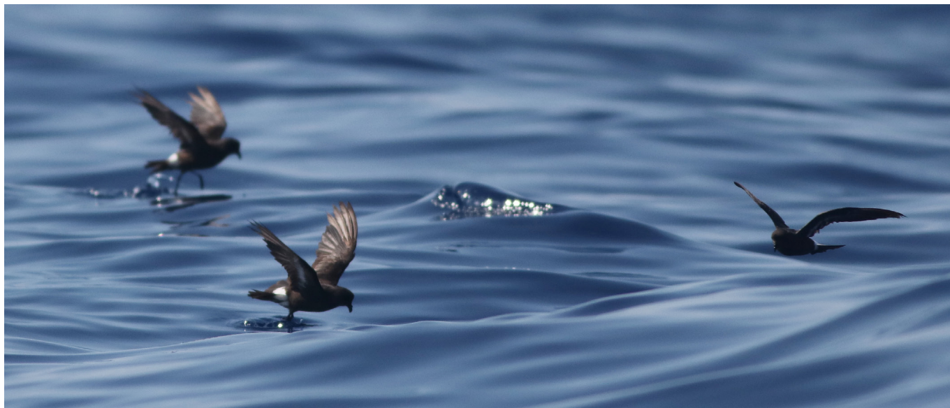
Fig. 04. European Storm-petrel (Marsaskala offshore, 28 Aug)