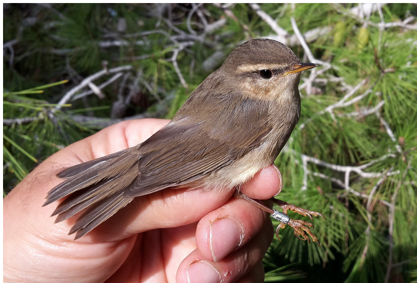
Fig. 21. Dusky Warbler (Ghadira NR, 07 Nov)

dates in Dec including 2 from 25–27 Dec at Xemxija.