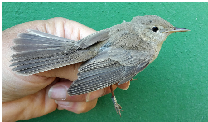
Fig. 19. Olivaceous Warbler (Ghadira NR, 16 May)