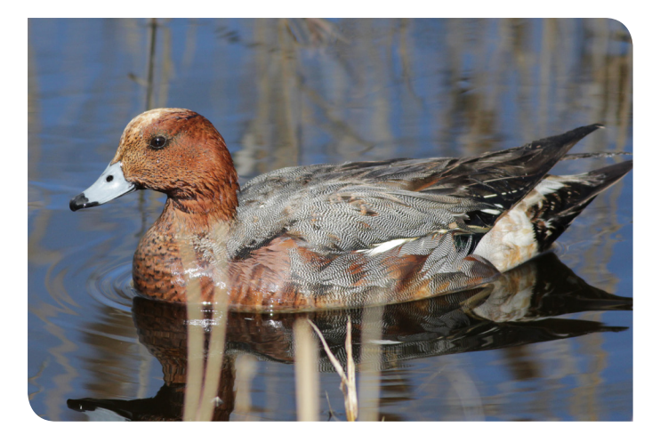
Eurasian Wigeon Mareca penelope