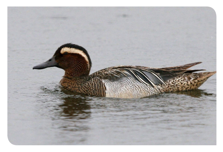
Garganey Anas querquedula