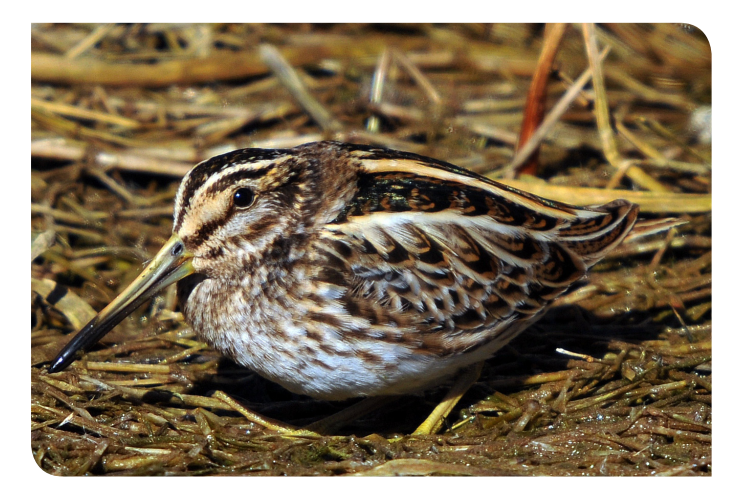
Jack Snipe Lymnocryptes minimus