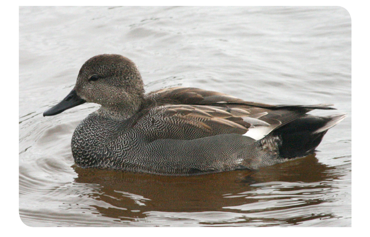
Gadwall Mareca strepera