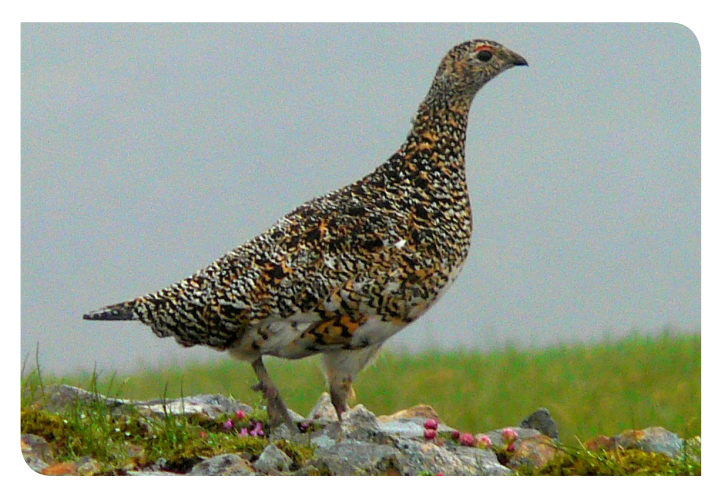
Rock Ptarmigan Lagopus muta