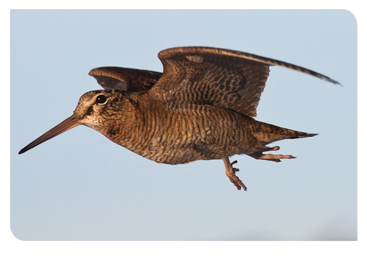
Eurasian Woodcock Scolopax rusticola