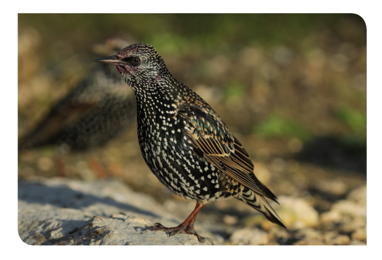
Common Starling Sturnus vulgaris