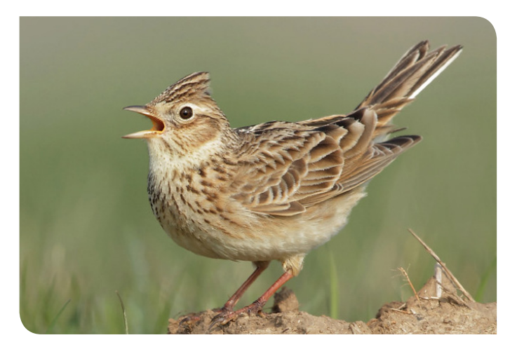
Eurasian Skylark Alauda arvensis