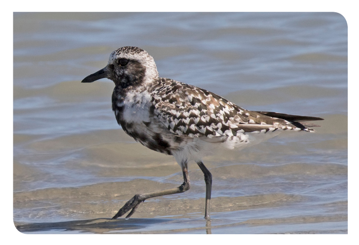
Grey Plover Pluvialis squatarola