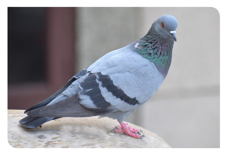
Rock Dove Columba livia