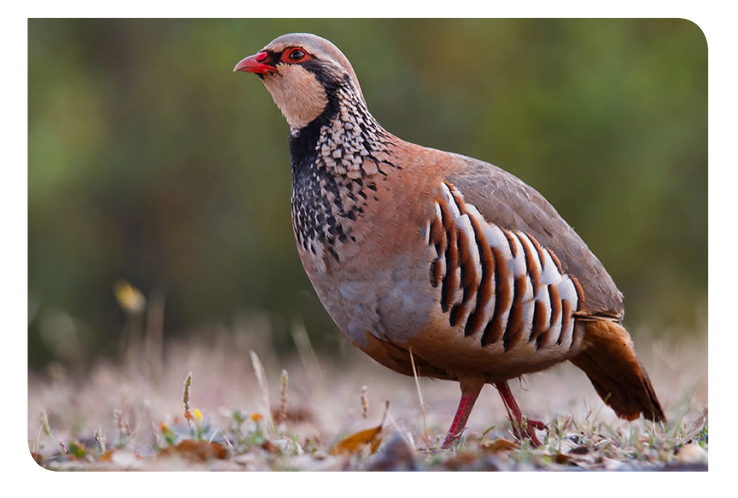
Red-legged Partridge Alectoris rufa