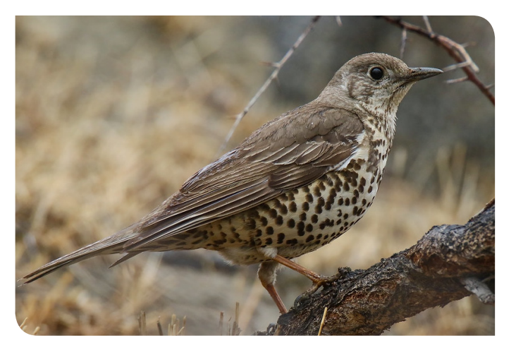
Mistle Thrush Turdus viscivorus