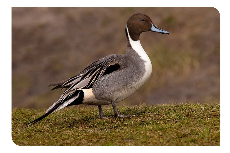
Northern Pintail Anas acuta