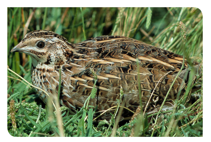
Common Quail Coturnix coturnix