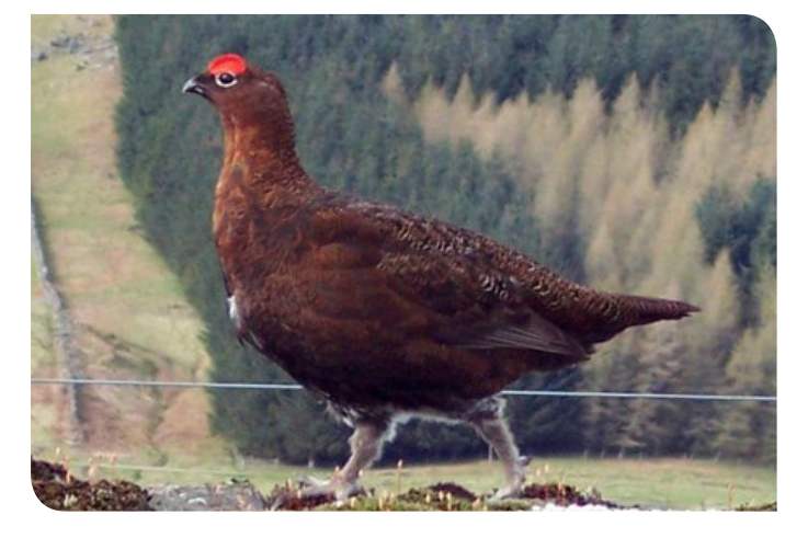
Scottish Red Grouse Lagopus lagopus scoticus