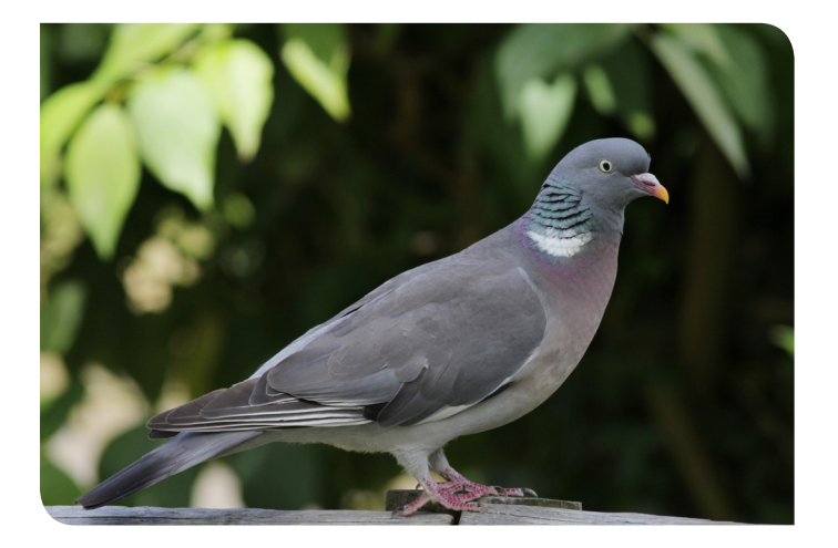
Common Woodpigeon Columba palumbus