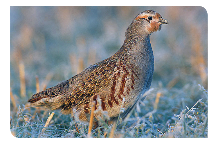
Grey Partridge Perdix perdix