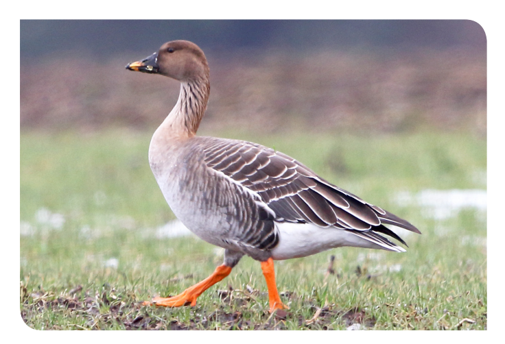
Bean Goose Anser fabalis