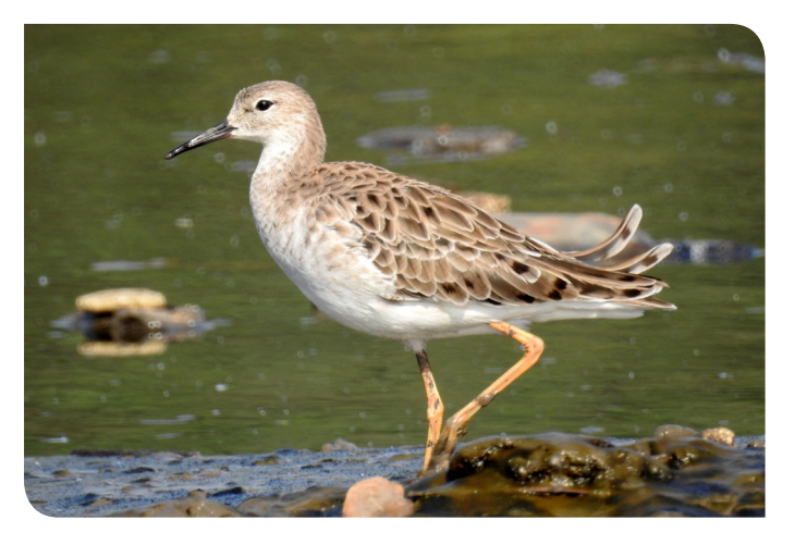
Ruff Calidris pugnax