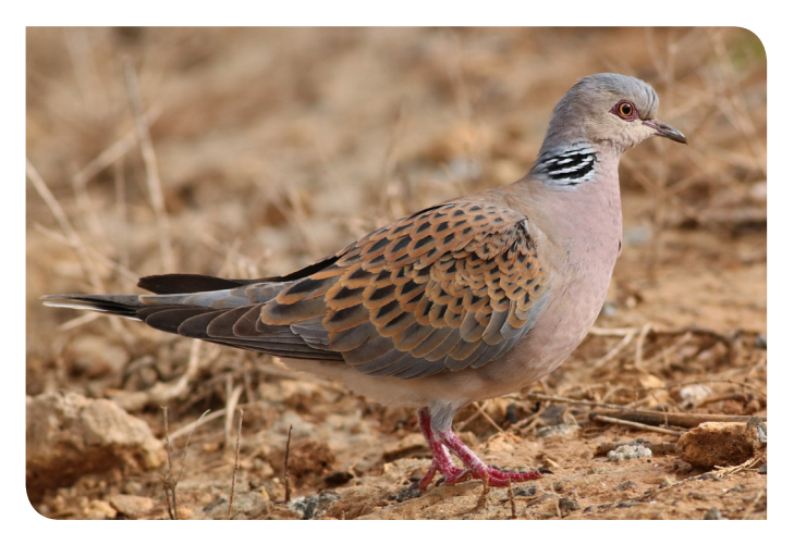
European Turtle-dove Streptopelia turtur