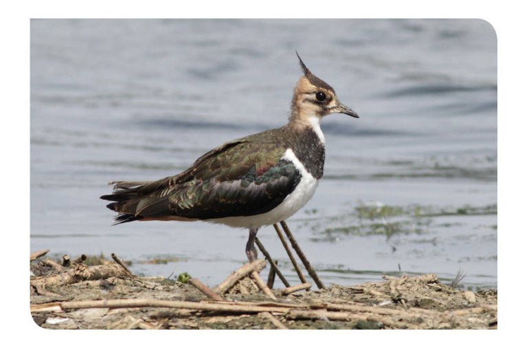
Northern Lapwing Vanellus vanellus