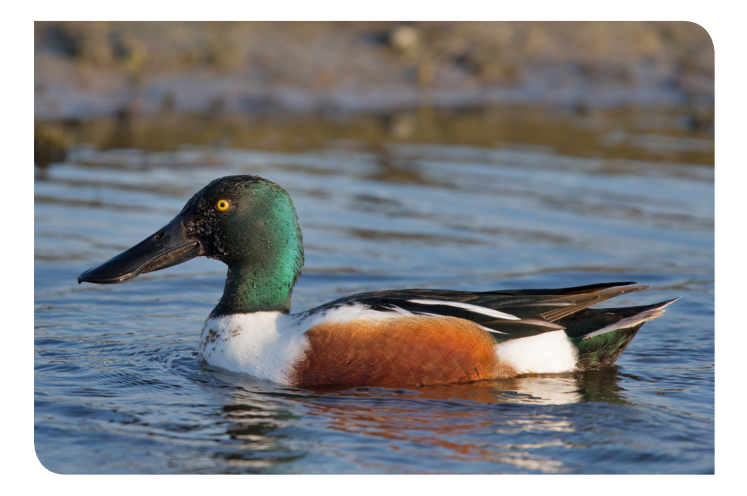
Northern Shoveler Spatula clypeata