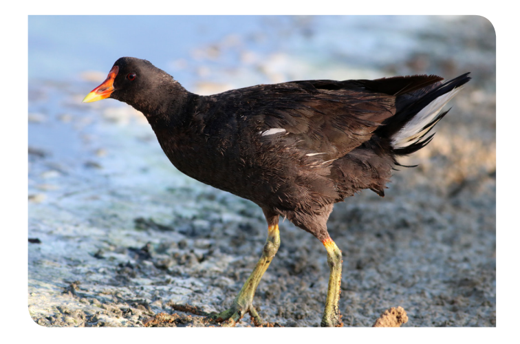
Moorhen Gallinula chloropus