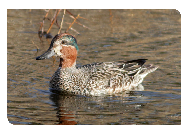
Eurasian Teal Anas crecca