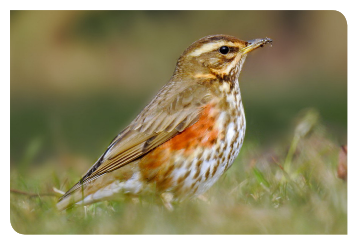
Redwing Turdus iliacus