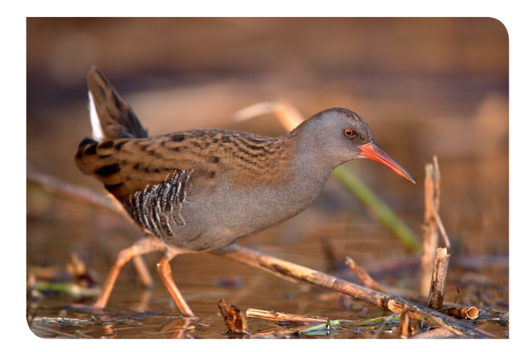
Water Rail Rallus aquaticus