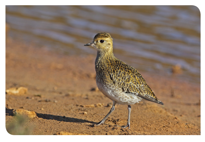
European Golden Plover Pluvialis apricaria