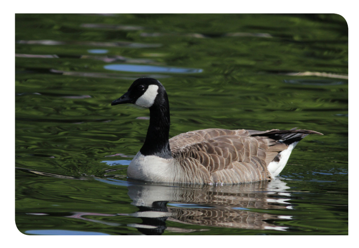
Canada Goose Branta canadensis