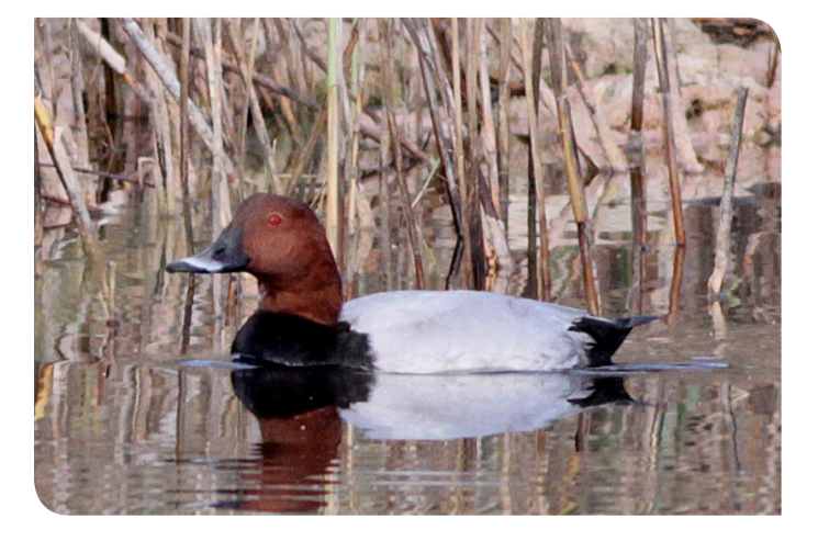
Common Pochard Aythya ferina