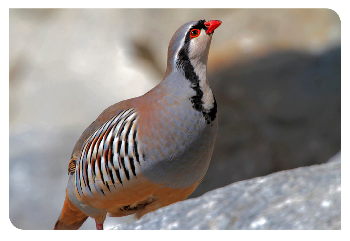
Rock Partridge Alectoris graeca