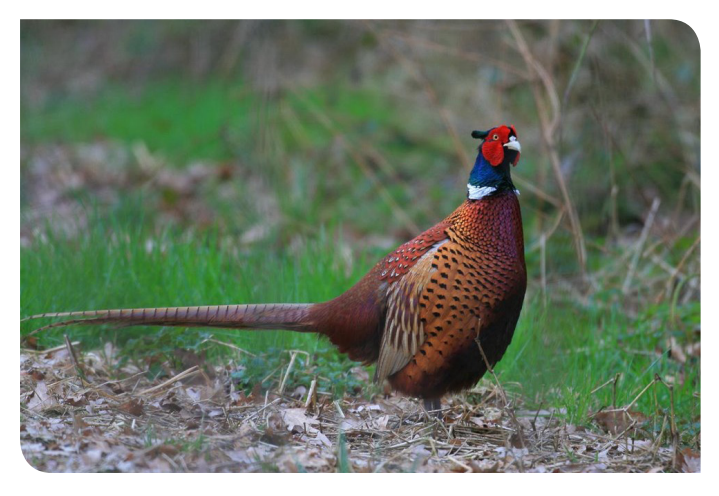
Common Pheasant Phasianus colchicus