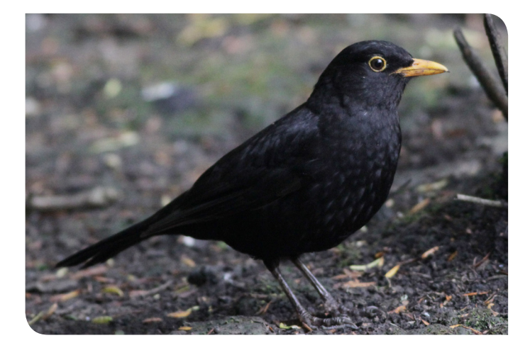
Eurasian Blackbird Turdus merula