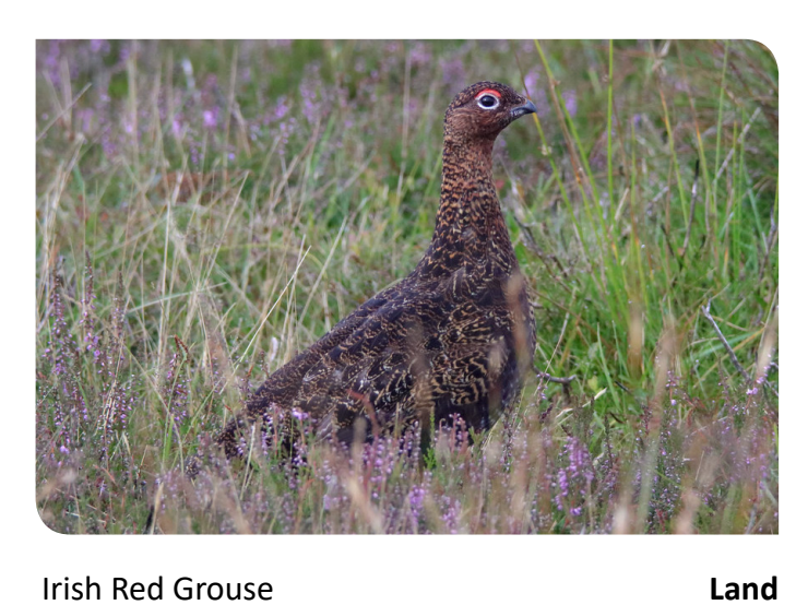
Irish Red Grouse Lagopus lagopus hibernicus