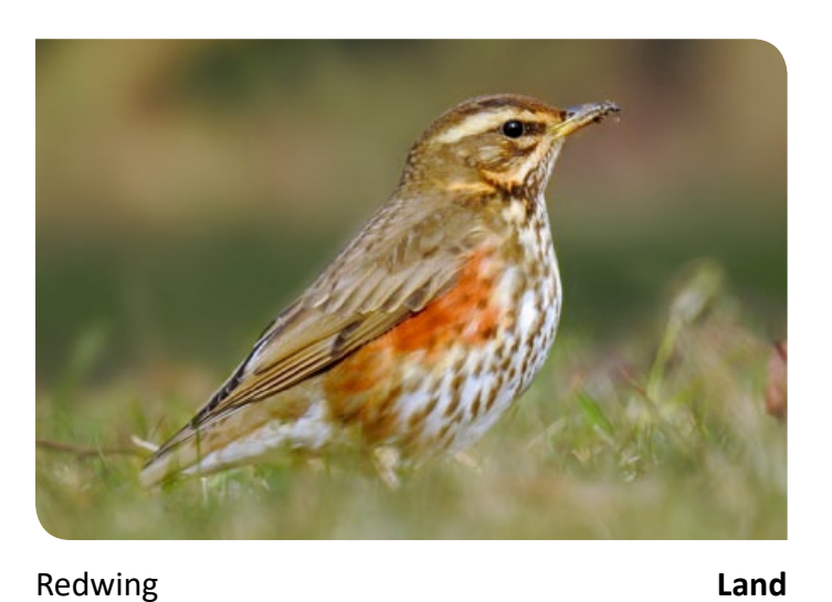
Redwing Turdus iliacus