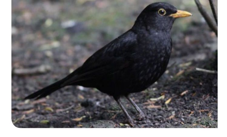
Eurasian Blackbird Turdus merula