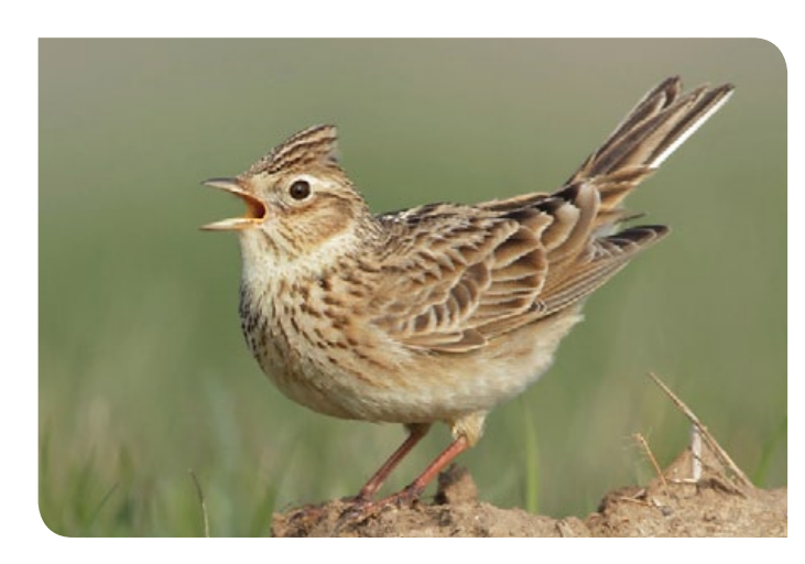
Eurasian Skylark Alauda arvensis