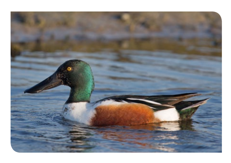
Northern Shoveler Spatula clypeata