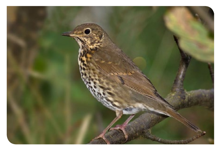
Song Thrush Turdus philomelos