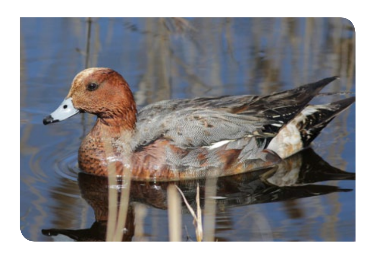
Eurasian Wigeon Mareca penelope