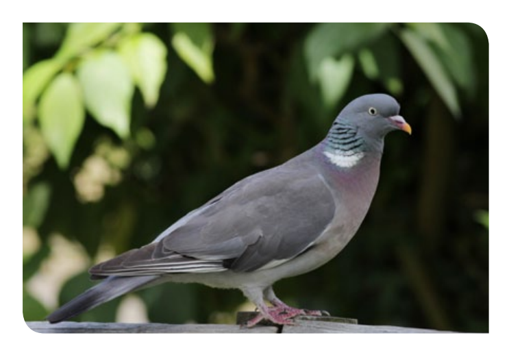
Common Woodpigeon Columba palumbus