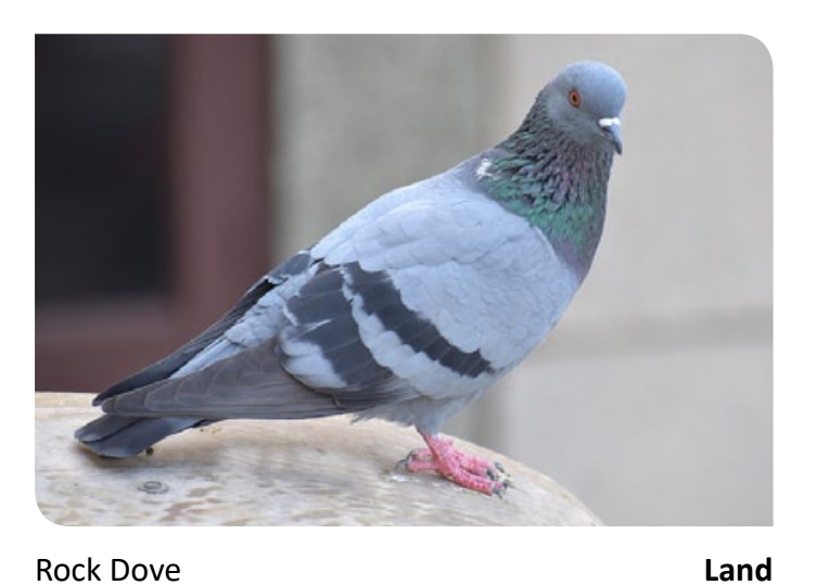
Rock Dove Columba livia