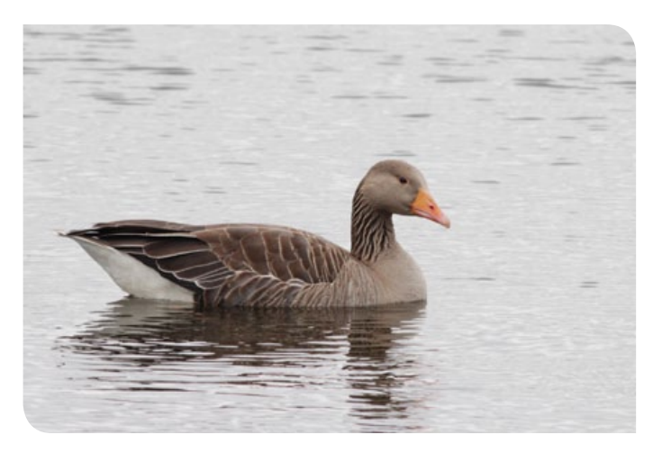
Greylag Goose Anser anser