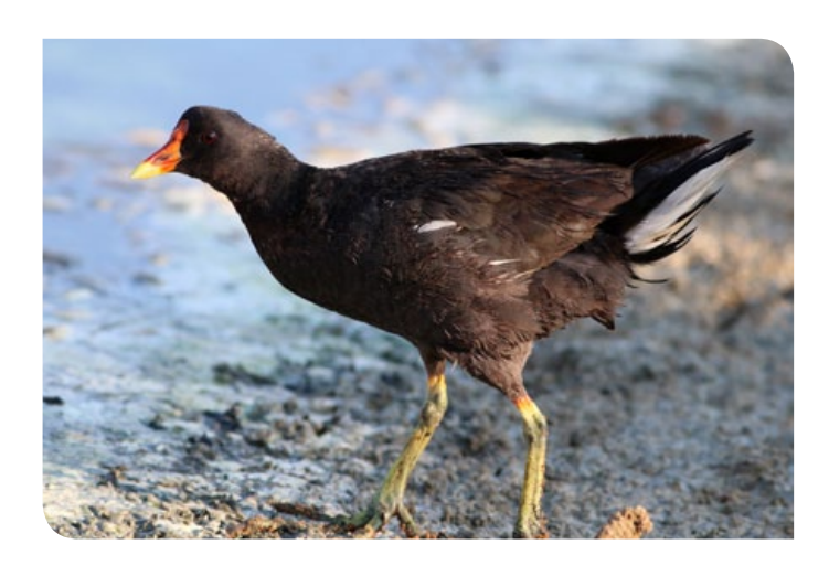
Moorhen Gallinula chloropus