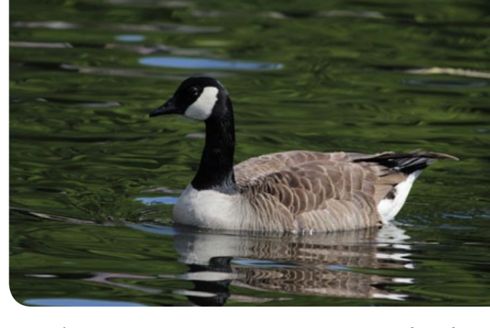
Canada Goose Branta canadensis