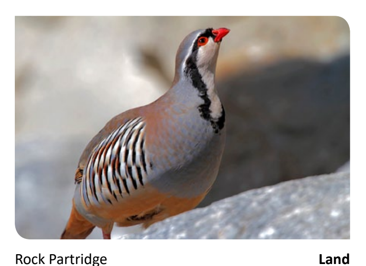
Rock Partridge Alectoris graeca