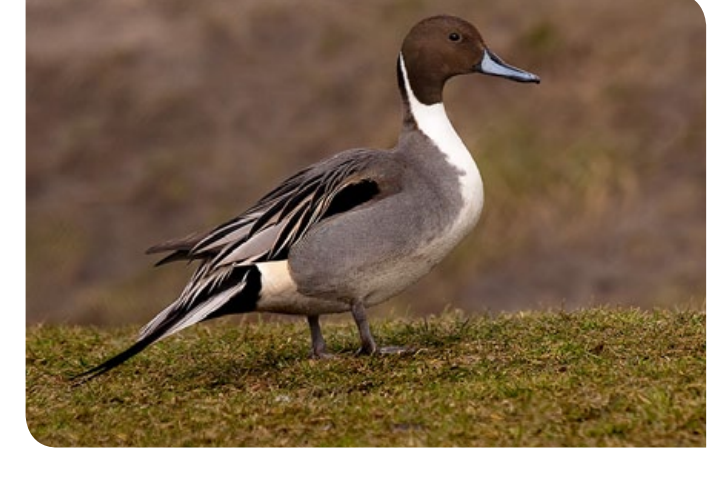
Northern Pintail Anas acuta