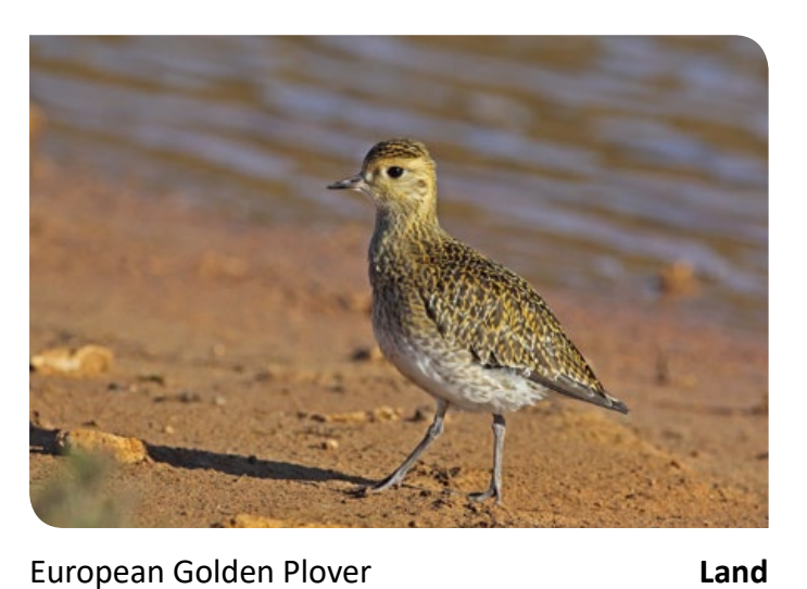
European Golden Plover Pluvialis apricaria