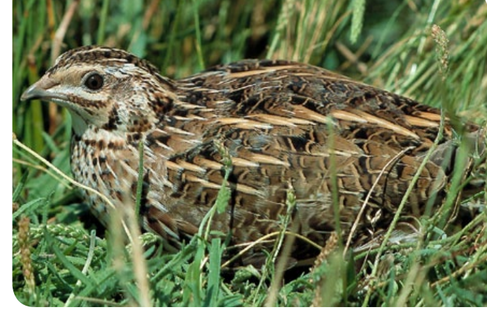
Common Quail Coturnix coturnix