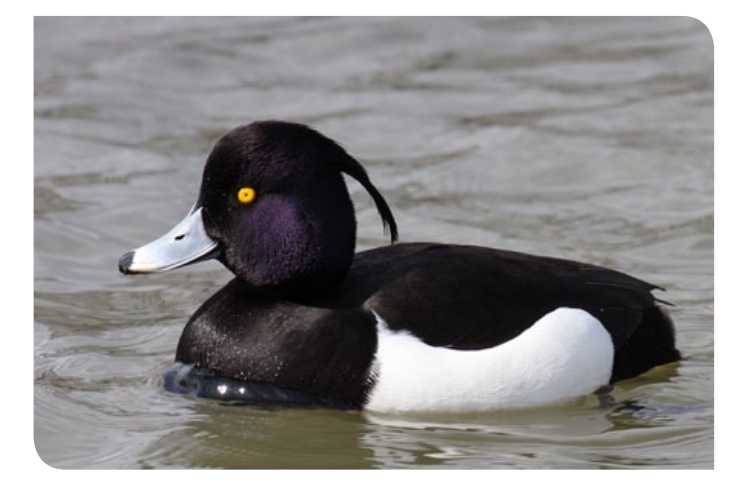
Tufted Duck Aythya fuligula