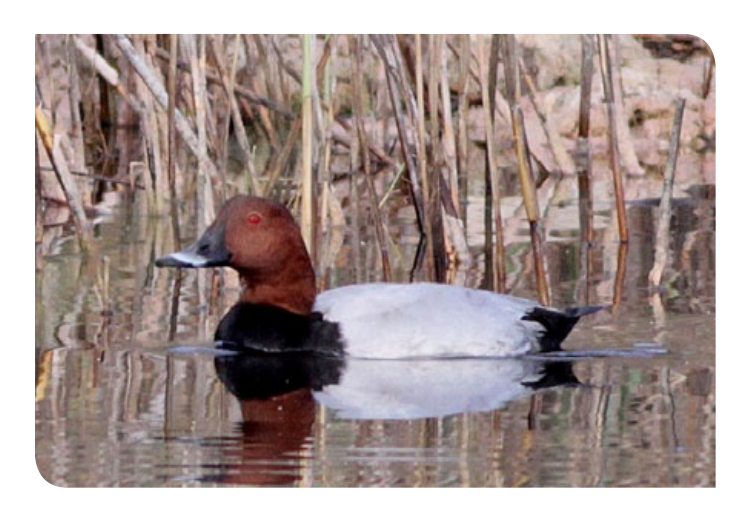
Common Pochard Aythya ferina