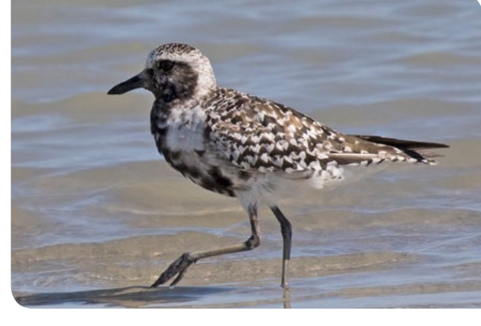
Grey Plover Pluvialis squatarola