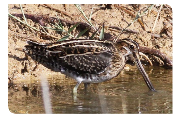
Common Snipe Gallinago gallinago