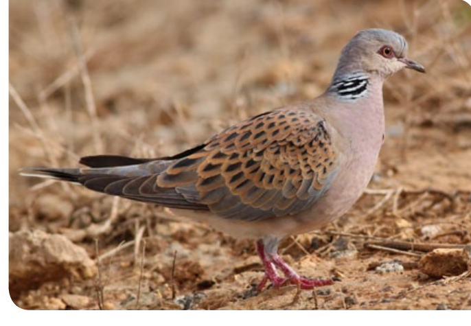
European Turtle-dove Streptopelia turtur