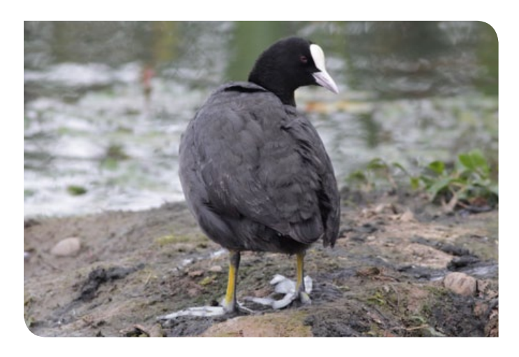
Common Coot Fulica atra