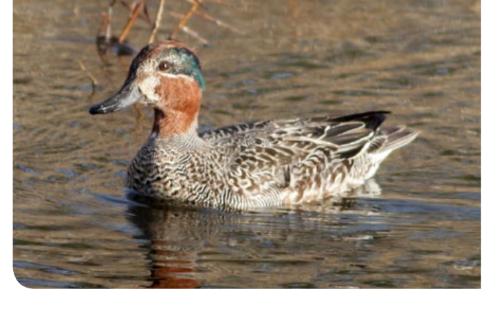
Eurasian Teal Anas crecca