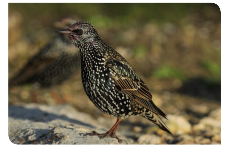
Common Starling Sturnus vulgaris