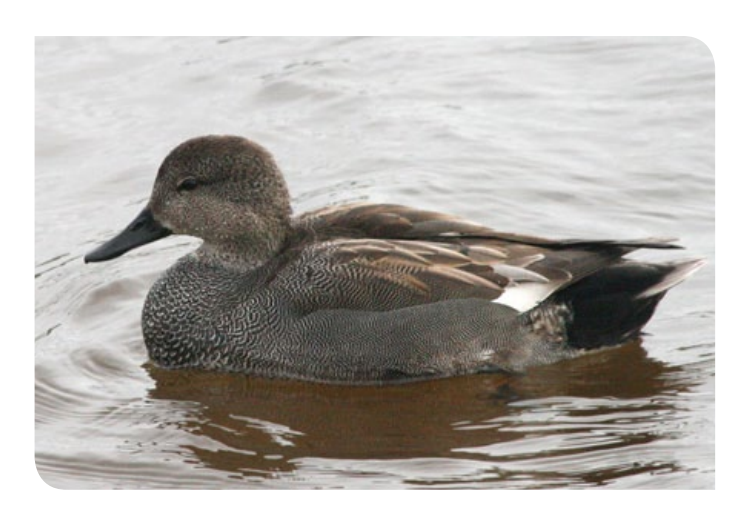
Gadwall Mareca strepera