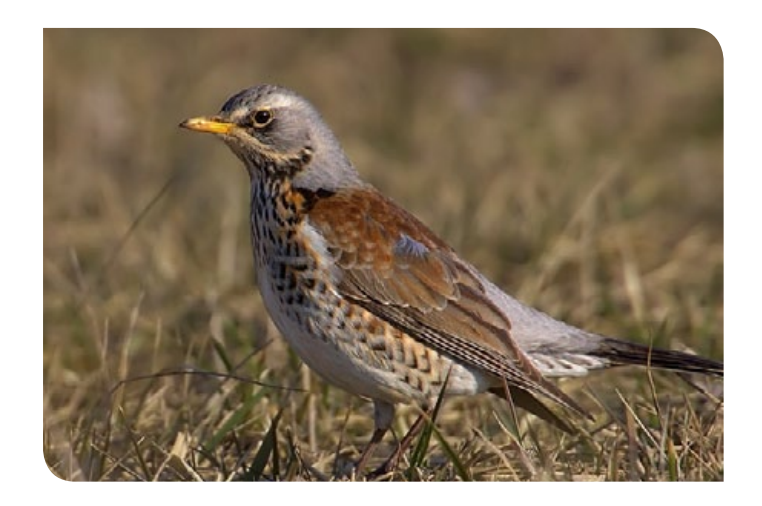
Fieldfare Turdus pilaris