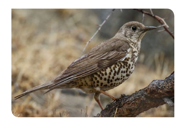
Mistle Thrush Turdus viscivorus