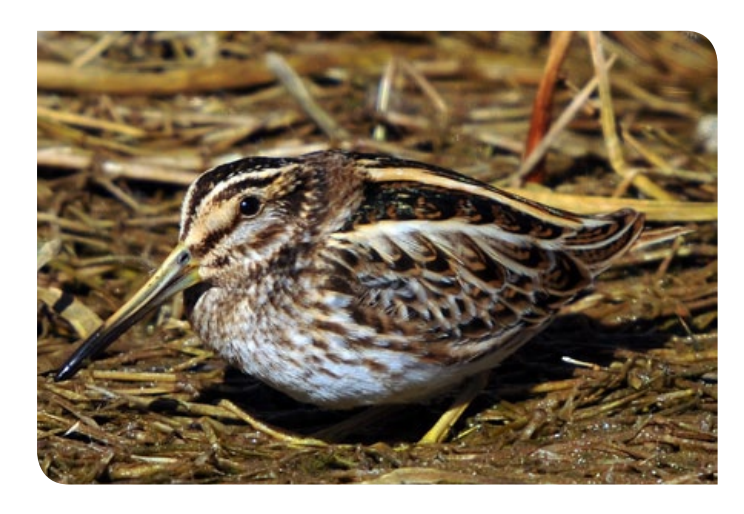
Jack Snipe Lymnocryptes minimus