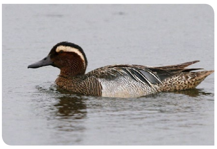
Garganey Anas querquedula