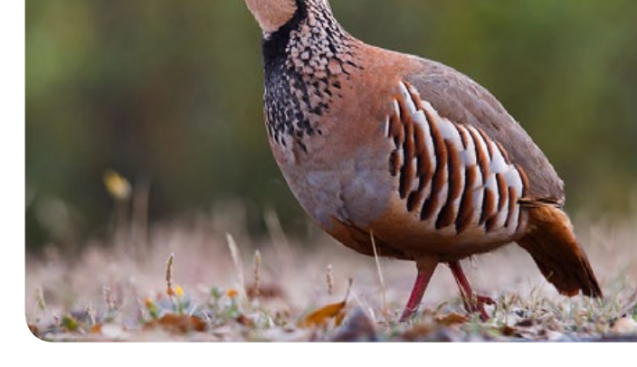
Red-legged Partridge Alectoris rufa