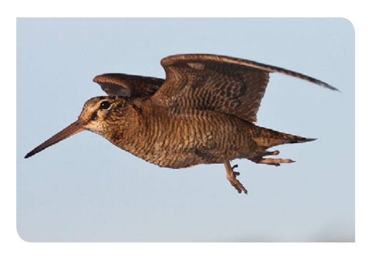
Eurasian Woodcock Scolopax rusticola