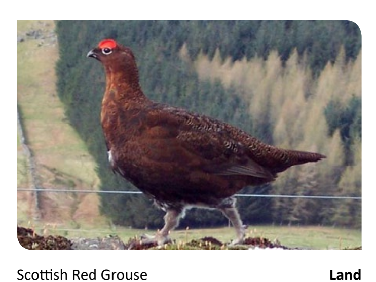
Scottish Red Grouse Lagopus lagopus scoticus