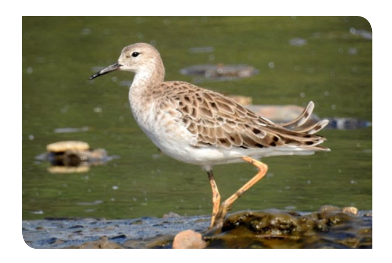
Ruff Calidris pugnax