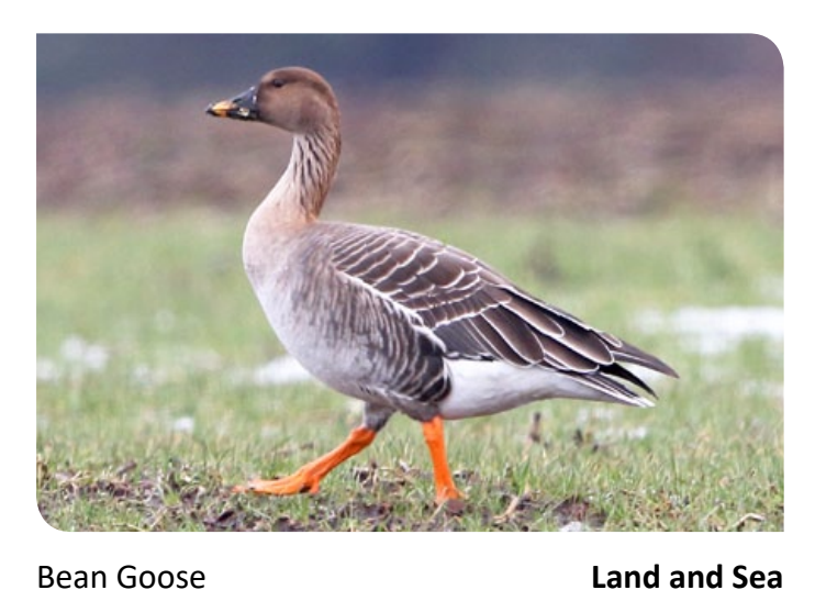
Bean Goose Anser fabalis