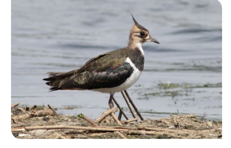
Northern Lapwing Vanellus vanellus