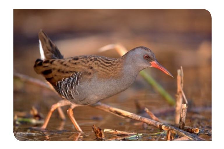
Water Rail Rallus aquaticus