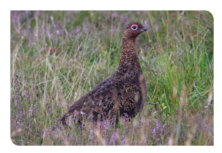
Irish Red Grouse Lagopus lagopus hibernicus