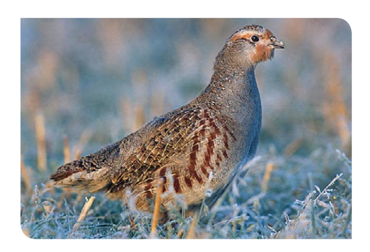
Grey Partridge Perdix perdix