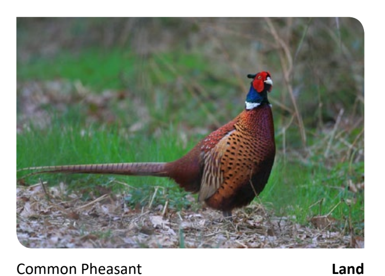
Common Pheasant Phasianus colchicus