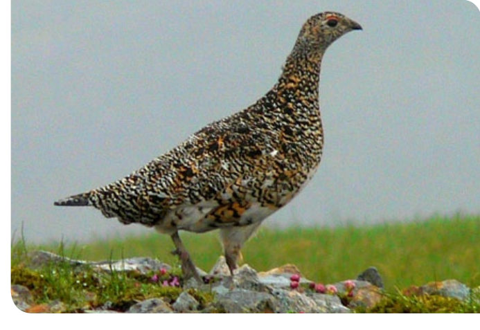
Rock Ptarmigan Lagopus muta