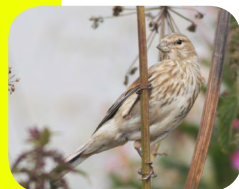
Linnet | Gojijn