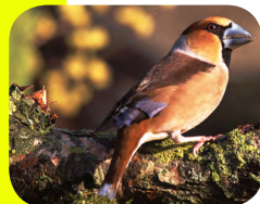
Hawfinch | Taż-Zebbuġ