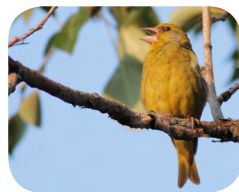
Greenfinch | Verdun

Become a member & follow us on social media www.birdlifemalta.org info@birdlifemalta.org #STOPTRAPPINGNOW