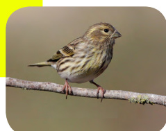
Serin | Apparell

www.birdlifemalta.org/information/trapping