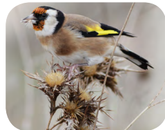
Goldfinch | Gardell