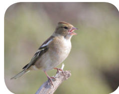
Chaffinch | Sponsun