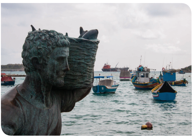
► Fisherman statue with "luzzu" fishing boats in the background

Follow the path until you reach the end and turn right and walk away from the coast until you see stone fences and a sign with the number 8 on it where you turn left. You will then find yourself immersed in beautiful greenery, surrounded by wild flowers and pine trees. Head downhill on the winding path then take the sharp left at the bottom where you will be able to see the Delimara power station - a sight hard to miss from its contrasting surroundings! Continue straight and when you see a street with a house on the left, just before the power station chimney, turn left for the longer but more scenic path embellished with vibrant flora, otherwise just follow the path and the signs straight ahead. You will shortly see the large cove II-Hofra ż-Żgħira on your left, which makes for a beautiful panoramic shot! Continue along and turn right to the natural path along the cliff and you will soon see St Peter's Pool below. Venture down the rocky track and