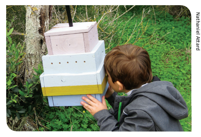
Christmas Nature Fair

It was amazing to see children enjoy themselves in nature whilst learning! There were various activities, including story telling sessions, bird ringing demonstrations, educational craft activities and exhibits raising awareness about environmental issues from various organisations.