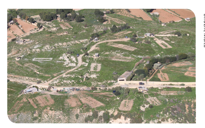
Destruction of natural habitats caused by trapping

For sure a trapping season in 2018 will bear the changes demanded of this important milestone, but until we see wild birds flying free in the skies where they belong, we will continue to shine a light on trapping.