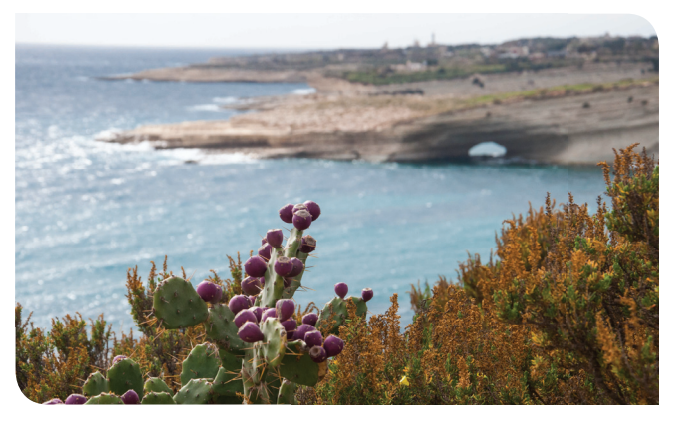
➤ The endemic Darniella melitensis plant (right) with II-Ħofra I-Kbira cove in the background