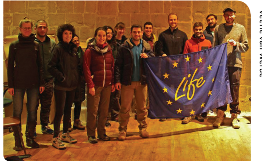
Yelkouan Shearwater call count team

February marked an exciting month in our education department as we launched a new course for primary school teachers in collaboration with the Institute for Education. The MQF Level 6 Award in Teaching Outdoor Learning through Nature will be delivered by BirdLife Malta and will provide teachers with the skills and competencies to deliver curriculumlinked activities in an outdoor setting. We hope the course will enhance environmental education in Malta as well as provide opportunities for more children to connect with nature.