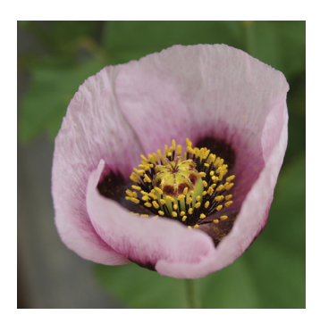
Colours of Malta

"It was fun, there were people from all walks of life taking part. We enjoyed the lovely nature and countryside"