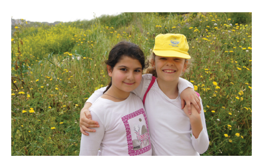
Friends enjoying the flower field

"Thanks to BirdLife Malta we have the reserves where we can learn more about the birds and watch them. They are very good in teaching the children as well about birds and insects"