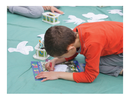
After walk activities

This concept was explored and developed to include that the connection between humans and nature can take the form of an interpersonal relationship, exploring the sense of self in relation to nature. As we form closer links and stronger bonds with the natural world, this is what motivates us to develop positive environmental behaviour.