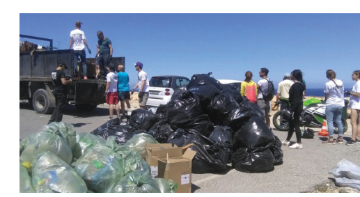
Waste collected at the clean-up.