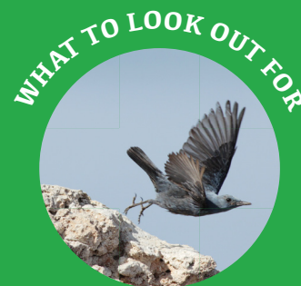
BLUE ROCK THRUSH Malta's national bird can be seen and heard easily in these areas

By public transport, take any bus to Cirkewwa Ferry Terminal (X1 – 41 – 42 -101 – 221 – 222) and take the ferry to start your trip from the Gozo harbour by following the walking path along the coast. From Xewkija to the Temples in Xagħra, you can take the bus 303 (every 25-35 minutes) stopping at the racetrack (the nearest bus stop to the temples) or you can opt to walk instead for around 35-45 minutes. The transport will cost approximately €10 per person (including Gozo ferry fee, without car) and between €5 and €9 per person for the tickets to access the archaeological site and museum.