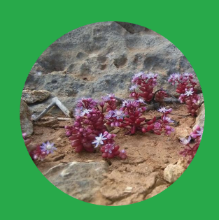
WILD AND CULTIVATED FLORA Such as Fig, Judas Tree, the endemic Maltese Salt-tree, Blue Stonecrop (pictured) and the endemic Maltese Rock-centaury