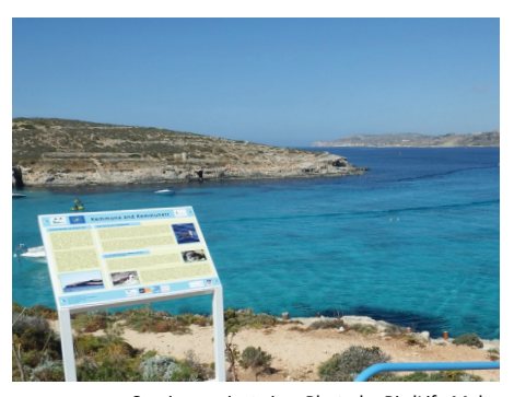
Comino project sign.

The LIFE Arcipelagu Garnija project has also deployed 12 project signs around the Maltese Islands in the areas where Yelkouan Shearwater colonies are situated. It is hoped that the signs will help to raise awareness about the breeding seabirds within Malta and the surrounding islands, their threats and the need for conservation measures. A new leaflet for the project has also been created and will be distributed to the public in the near future to improve engagement.