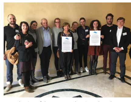
Adoption of the Rome Declaration.

The project is continuously working towards mitigating the impacts of air pollution which have not only been linked to causing serious health conditions but also climate warming and, a significant loss of productivity in agriculture and a negative impact on biodiversity. With the implementation of suitable monitoring equipment in Malta, valuable scientific data on air pollution caused by marine traffic in the area could be collected to work towards tackling the issue.