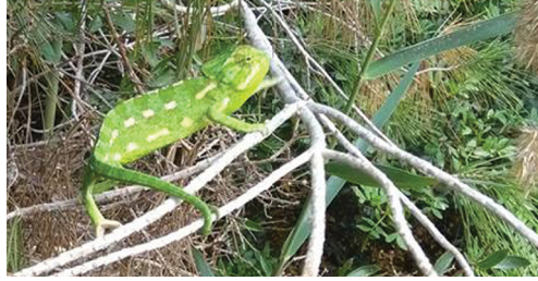
European Natura 2000 Day at Simar.