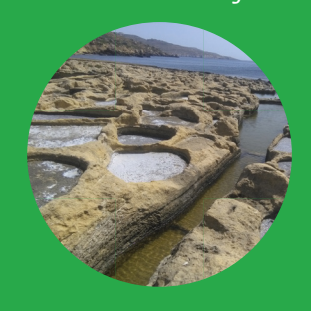
OLD SALTPANS The area is characterised by a checkerboard of rockcut saltpans protruding into the sea dating back about 350 years