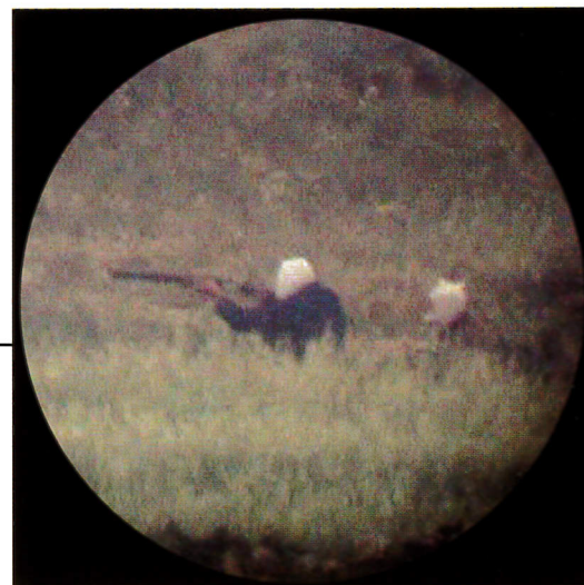
Armed and anonymous. Some poachers have taken to wearing balaclavas to hide their faces. The two pictured above were caught on camera by a BirdLife Malta team. The poachers were tracked down and apprehended by the police - a court case is under way.

As with our other camps, this year's Camp had its share of good news and bad news. Despite the ban on spring hunting, our teams recorded 2699 shots (596 on 23 April alone). Furthermore, illegal hunting incidents were widespread and recorded in most sites visited by our teams, especially in well-known hotspots in the south, such as St Thomas Bay, Delimara and San Niklaw. Illegal hunting was also focussed on areas where large numbers of birds of prey congregate or come in to roost. The fields directly adjacent to Gudja International Airport, particularly on the southern side, continue to be one of the most notorious areas, as is Tal-Handaq valley just north of the runway. That poaching can be so prevalent and persistent next to Malta's international airport speaks volumes about the