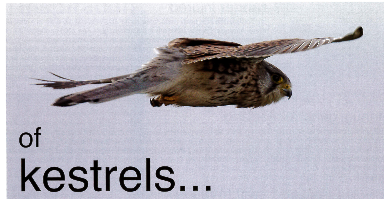
Sean Gray (www.seangrayimages.co.uk)