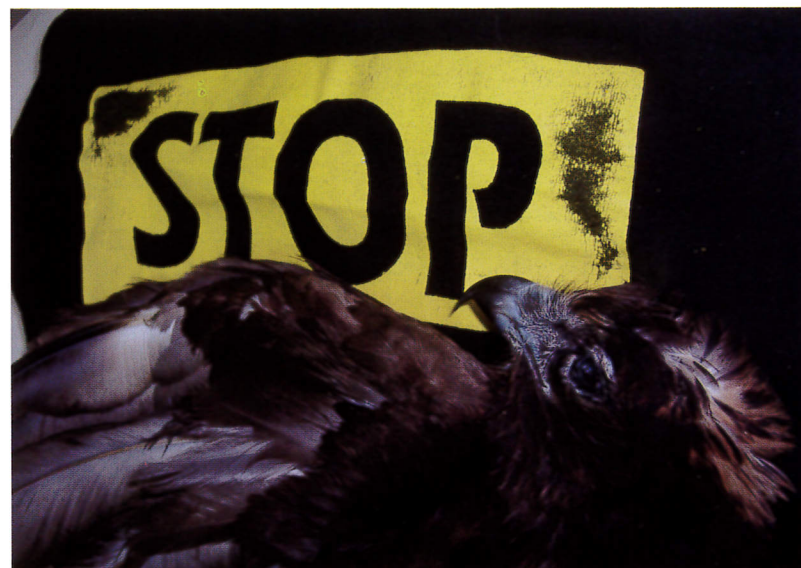
End of the road. Being large raptors, relatively common and often flying low in search of somewhere to roost, Marsh Harriers often fall victim to poachers' guns. The one pictured above was shot down this spring.

There were also sinister developments in the way some poachers are adapting to the increased surveillance by Spring Watch and the heightened police presence. Several poachers were seen wearing balaclavas to conceal their identity. This development increases the seriousness of the situation in the countryside: these individuals are now essentially masked gunmen! In other cases, poachers have changed from shooting raptors by day to killing them at night. Camp teams recorded numerous instances of hunters pinpointing the fields where flocks of harriers landed to roost, then returning at night with torches and shooting the birds as they slept. By what stretch of the imagination can such barbaric activity be called hunting? It is simply killing for killing's sake.