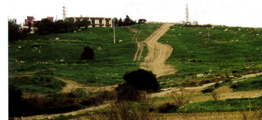
Abused land. A 1999 photograph of It-Taflija shows an offroad track and a derelict holiday complex. Sadly, the latter is still there today.

Foresta 2000 is a joint project of BirdLife Malta, Din l-Art Helewa and PARK.