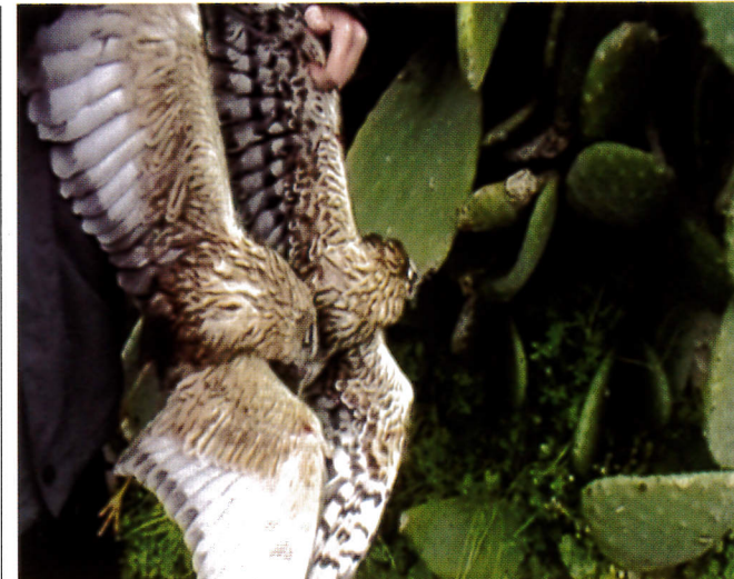
Fresh kill. Very early on in the camp, a Spring Watch team found these two freshly-killed harriers in a field, close to where a poacher had managed to run and evade the police.

As another breeding season gets under way, we (and maybe