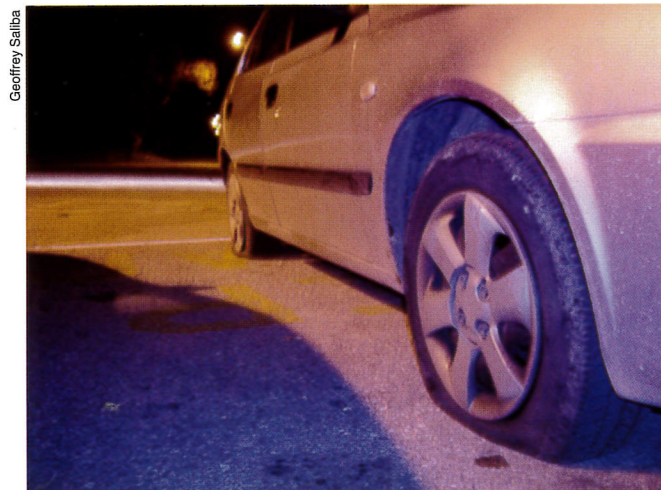
Flat out. Late at night on 24 April 2009 three men were seen approaching the parked Spring Watch cars. When challenged they ran off, slashing two tyres of the nearest car and shouting obscenities in their escape. The police were on site minutes later but by then the criminals had disappeared. An hour later, a number of shots were heard.