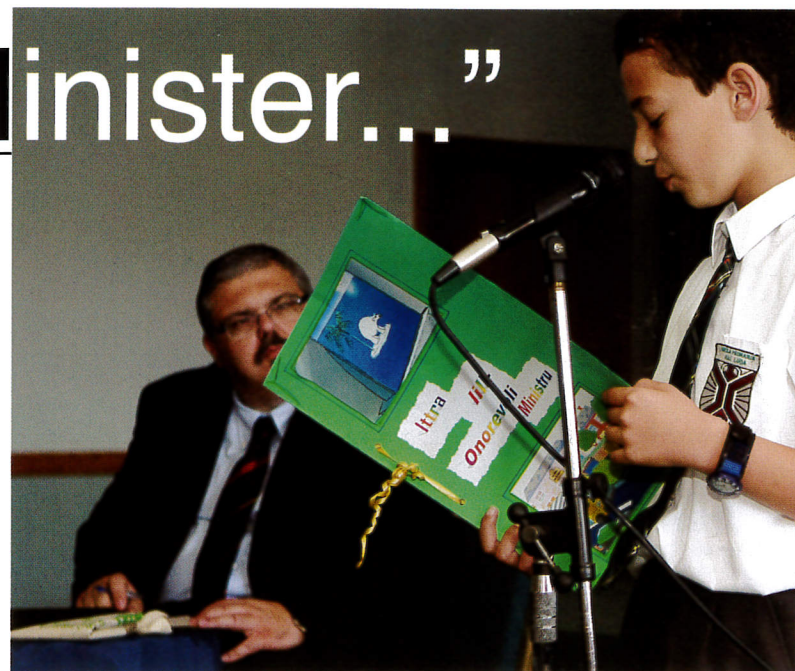
Andrew Gauci Altard / BirdLife Malta

The letters certainly aired the children's complaints and concerns, but they were not lacking in recommendations either. Suggestions included nation-wide campaigns, the building of infrastructures such as windfarms, government subsidies for environment-friendly equipment, and calls for new legislation and law enforcement.