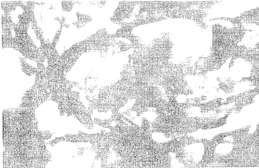
Male Sardinian Warbler. 293 of this resident species were ringed in 1972.