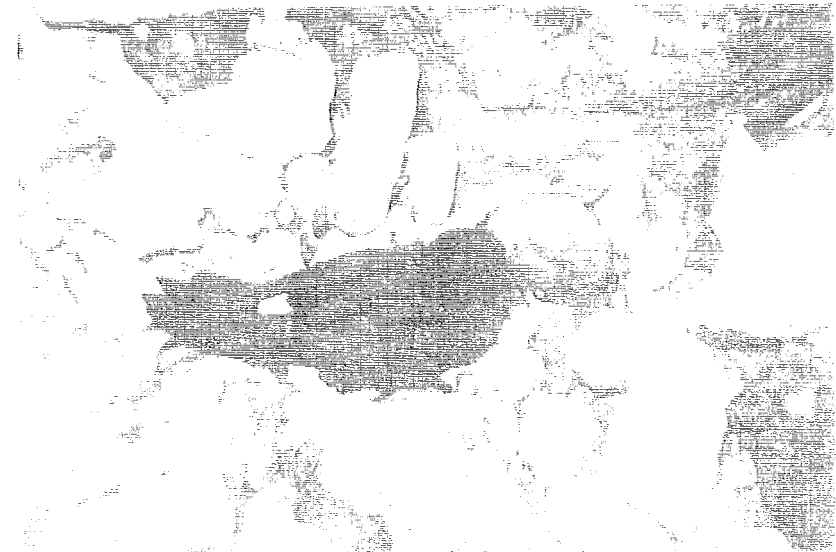
Storm Petrel. Over 1,200 Storm Petrels were ringed during one single night.