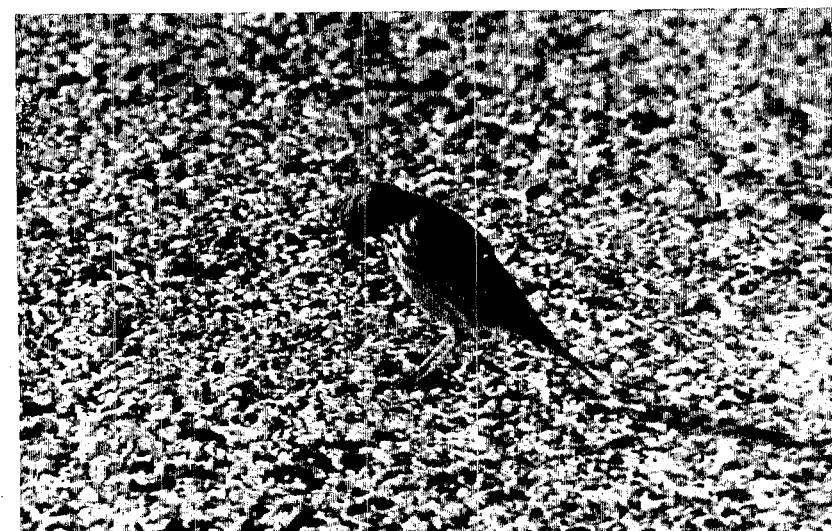
Meadow Pipit: common winter resident