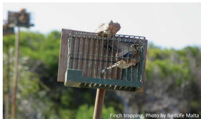
Finch trapping.

Clearly, more than ever we must put pressure as part of a partnership to bring forward European issues in front of our Government, which holds the Presidency whilst still working on matters that affect our patch.