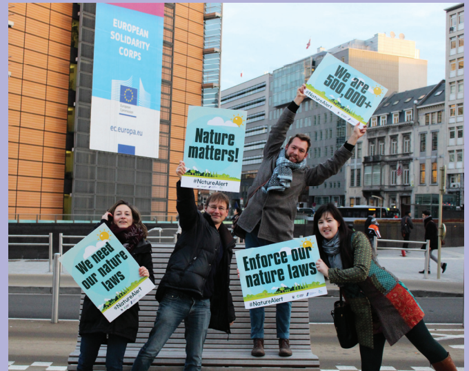
Nature Alert action held in Brussels on December 7th.