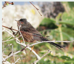
Dartford Warbler

January brought some exciting rare sightings. A scarce winter visitor, a Dartford Warbler was spotted in the boulder scree of Qammieħ in the north of Malta, the first time this bird has been seen on the island since 2013. After the sighting of the Dartford Warbler, a Marmora's Warbler was also observed by a BirdLife Malta birdwatcher in Dwejra, Gozo. This is only the 12th record of this species in the Maltese Islands in the last 100 years. Finally, a very rare Olive-backed Pipit was also reported by a hunter. This species is usually found migrating in winter to southern Asia and Indonesia.