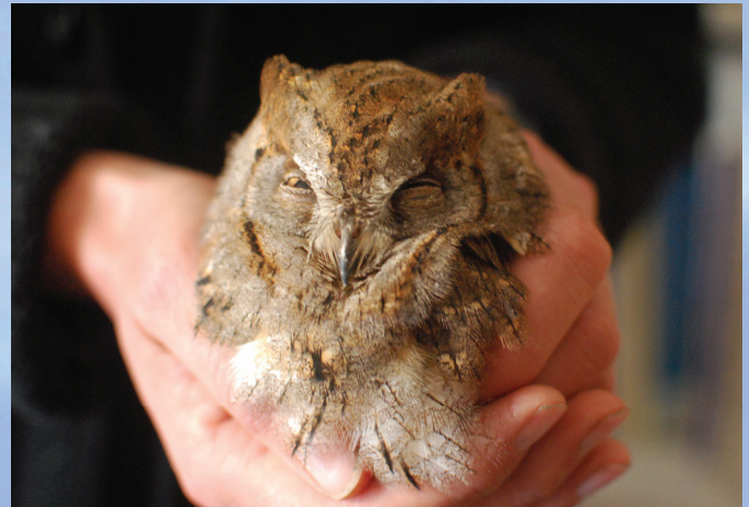
The Scops Owl is a common victim of collisions, especially against windows.