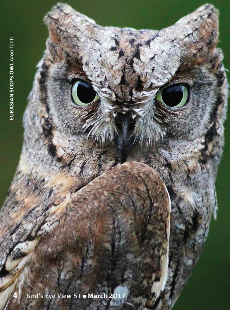
EURASIAN SCOPS OWL