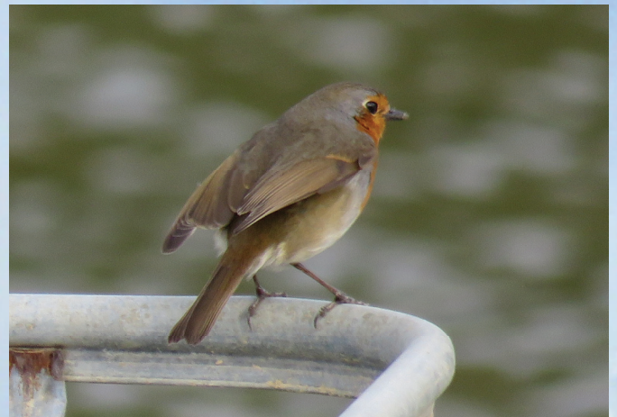
Robins are commonly seen throughout winter, and often suffer collision injuries.

It is not always this easy. Sometimes when injuries are too extensive or shattered wings would prevent birds from flying again enabling them to live in the wild, the only option is to put them to sleep. A difficult, but necessary choice – wild birds can't live in captivity. Some other times it takes months of care and rehabilitation before a bird can be released. Lots of Common Starlings and Song Thrushes, species that can be legally hunted, end up living with us during winter as they recover from their shotgun injuries. They are strong animals capable of extraordinary recoveries and they can often be released in the wild. But they sure do need a lot of food! Our mealworm colonies are completely exhausted by the end of December.