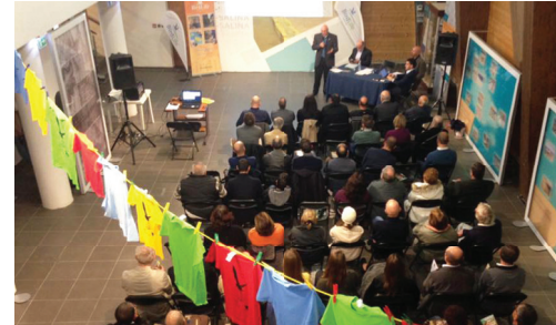
BirdLife Malta AGM.