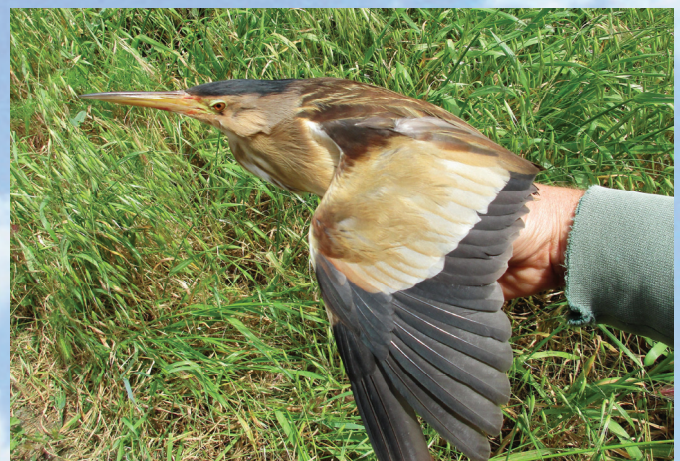
A very displeased-looking Little Bittern gets ready to be released after been rescued in St. Paul’s Bay.