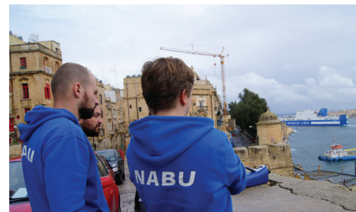
Together against Air Pollution project launch.

In December, BirdLife Malta officially launched a new project to raise awareness in Malta and the Mediterranean about air pollution from cruise ships. The objective is to establish a Sulphur Emission Control Area (SECA) in the Mediterranean. The project, which is in partnership with NABU (BirdLife Germany) and several other European NGOs, will work collaboratively to regularly exchange information, knowledge and expertise through periodical conferences which will discuss air pollution from ships.