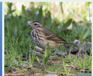
Olive-backed Pipit

We are delighted to announce that in January, we hit the milestone of 10,000 likes on our BirdLife Malta Facebook page! We are happy to see so many people supporting and engaging with our work. If you haven't already, please visit and like our Facebook page to receive regular updates on our work, including exclusive video footage and photos. We have also launched a brand new Facebook page for Is-Salina Nature Reserve as well as a Twitter and Instagram account for our Falko group.