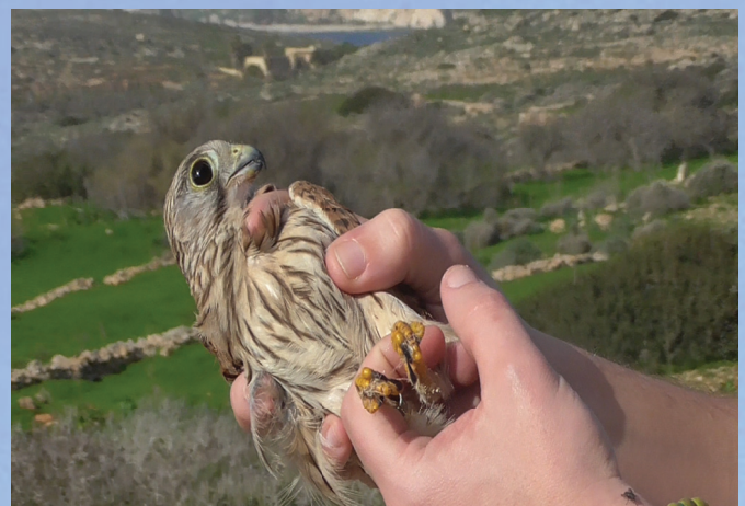
In 2016 five Common Kestrels, all confirmed shot, were rehabilitated and successfully released in Comino.