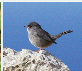
Marmora's Warbler