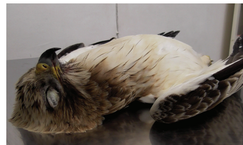
Shot Booted Eagle.

The 31 January 2017 saw the end of the autumn hunting season, one month after the closure of the trapping season. The hunting season saw a high number of illegalities, including the killing of protected birds such as Booted Eagles. BirdLife Malta and the Committee Against Bird Slaughter (CABS) also revealed that over a third of active trapping sites were not registered and illegal, while the remaining sites permitted by the Wild Birds Regulation Unit (WBRU) within Natura 2000 sites were in possible breach of habitat protection regulations. The results followed an earlier appeal by both organisations against the illegal use of electronic bird callers throughout the trapping season. BirdLife Malta and CABS continue to stress the need for a central authority with respect to enforcement on environment.