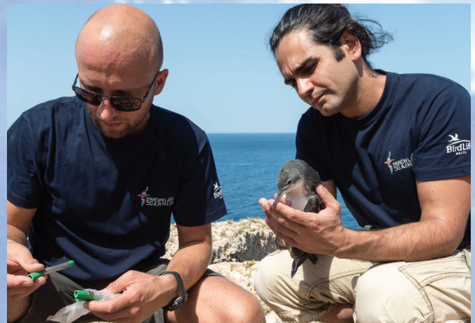
Carmel, one of the two Yelkouan Shearwaters hand-reared by BirdLife Malta, gets ready to be ringed and released.