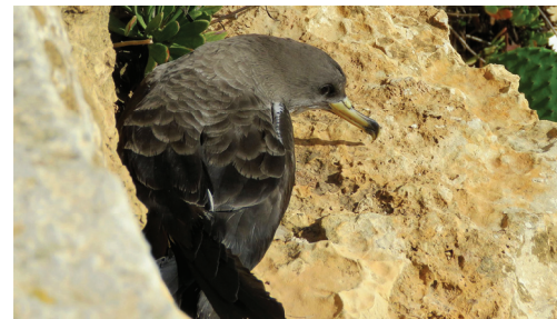
Stranded Scopoli's Shearwater.

At the end of last year, BirdLife Malta and the LIFE Arcipelagu Garnija team urged the public to report any sightings of stranded Scopoli's Shearwaters that may have become disorientated by light pollution during the fledging period. With the help of the public, a record 21 fledglings were recovered and subsequently ringed and released back into safe areas by BirdLife Malta. Moving into 2017, January and February marked the mating period for the Yelkouan Shearwaters. During this time, the LIFE Arcipelagu Garnija project staff were busy monitoring the activity in the different colonies, using methods such as remote camera trails.