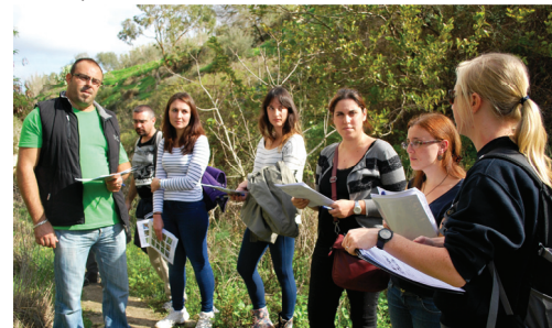
LLN and MCAST collaboration.

BirdLife Malta will be collaborating with Malta College of Arts, Science and Technology (MCAST) as part of the Lifelong Learning through Nature (LLN) project which provides students with unique learning opportunities whilst benefiting from spending time in nature. Thanks to this new partnership, two new Learning Outcomes related to environmental sustainability have been developed specifically for MCAST which will include an element of outdoor education through a field trip. This will give students the opportunity to undertake investigations during a guided field visit to a natural area.