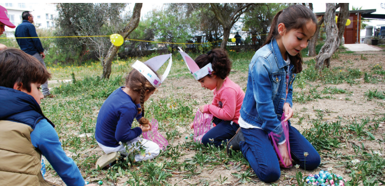
Easter Egg-citement 2016.

Here is the perfect opportunity for your children to take part in a guided activity which will include an Easter Egg Hunt, nature detective activities and exploration at the nature reserve. There will be sessions lasting 90 minutes throughout the day.