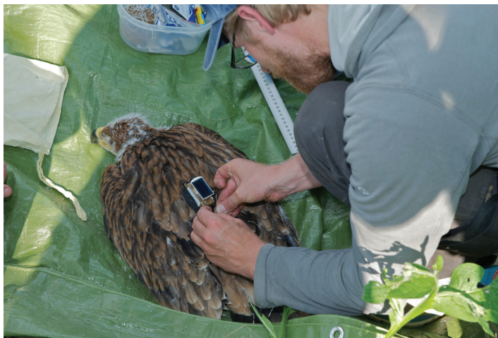
IMPERIAL EAGLE TRACKED OVER MALTA BirdLife Austria