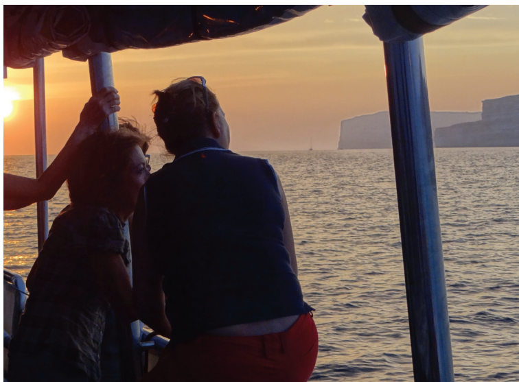
The Malta-Gozo channel is Malta's first Marine IBA