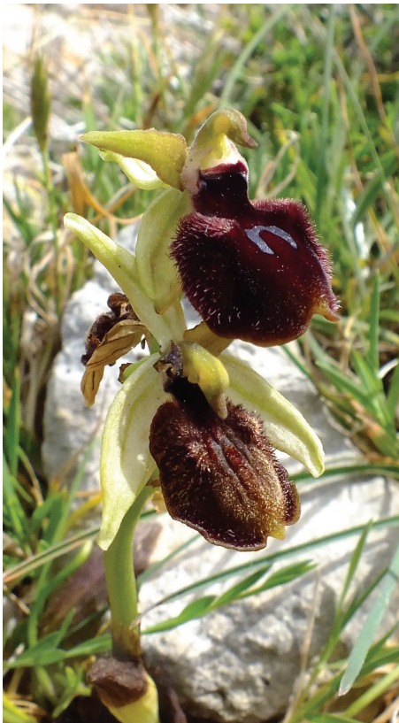
MALTESE SPIDER ORCHID