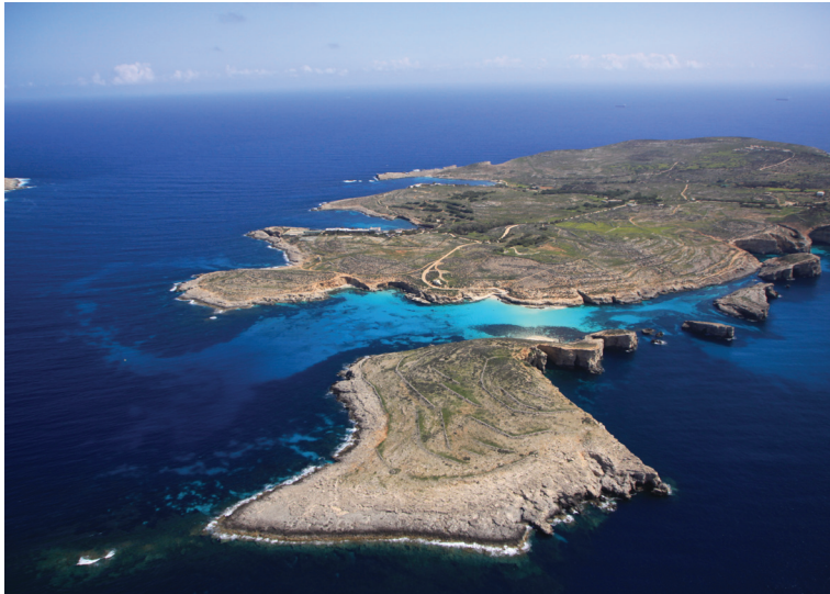
Comino is protected as an IBA and Natura 2000 site