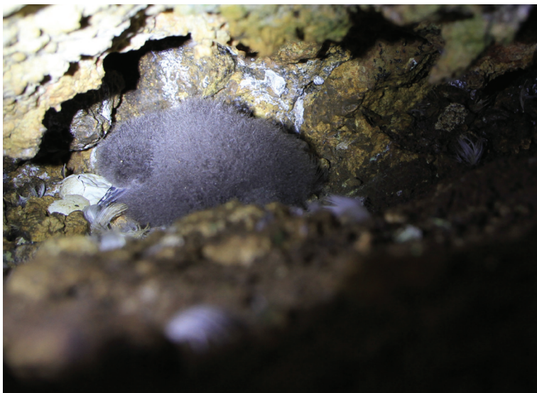
IBAs safeguard shearwater breeding sites in Malta