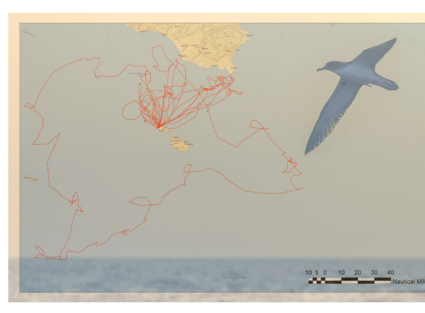
GHAWDXIJA'S FLIGHT PATH AROUND MALTA Malta Seabird Team