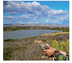
Pallid Harrier shot in 2013 in Malta, released by the Azienda Foreste Demaniali in Sicily this year.

Thank you if you donated to our appeal for funds for a bird rehabilitation centre to be set up at Buskett. Thanks to your generosity, we have raised nearly \leq 10,000 , and with other promises of support, we need just \leq 9,000 to set up the centre. If more money is donated, birds like this Pallid Harrier that was shot in Malta and sent to Sicily for rehabilitation, will be treated in Malta, increasing their chances of survival. Please support this project by making a donation if you can.