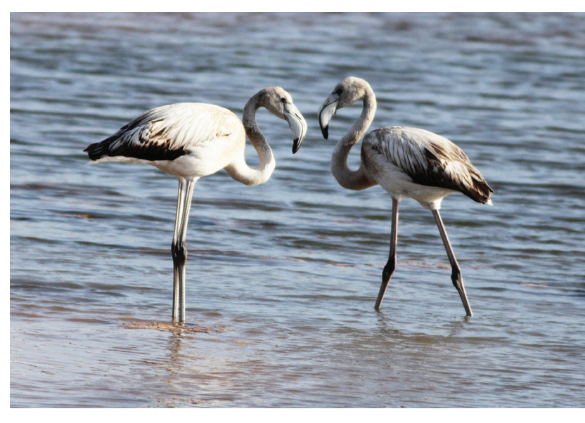
FLOYD AND FANNY AT GHADIRA NATURE RESERVE Aron Tanti