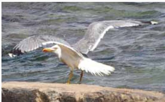
The 'teenage' gull shortly after its release.