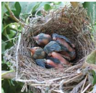
(left) A male blackcap, and (right) the Buskett nest with the two very young fledglings.