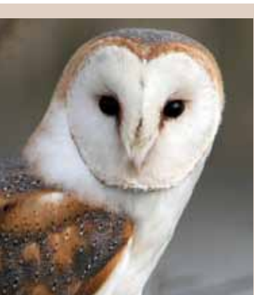
The Barn Owl would breed regularly were it not for persecution by hunters