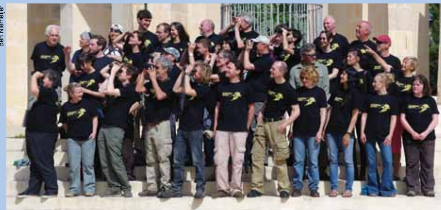
In tight formation. Sporting the Spring Watch 2012 T-shirt, participants of this year's camp take a break at Salina to pose for a group picture.