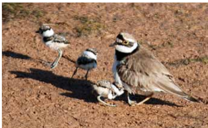
One of this year's little ringed plovers with its brood of four (one chick almost entirely hidden underneath the parent bird).