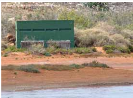
MBROC funded the building of the hide at Ghadira in the 1980s. Every year, this little green room gives thousands of people - not least schoolchildren - the joy and inspiration of watching birds in the wild.