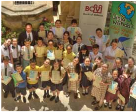
Group photo of some of the children who took part in Dear Minister 2012, with Environment Minister Dr Mario de Marco.